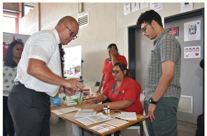
LAB TEAM GIVING INFORMATION ON BLOOD DONATIONS