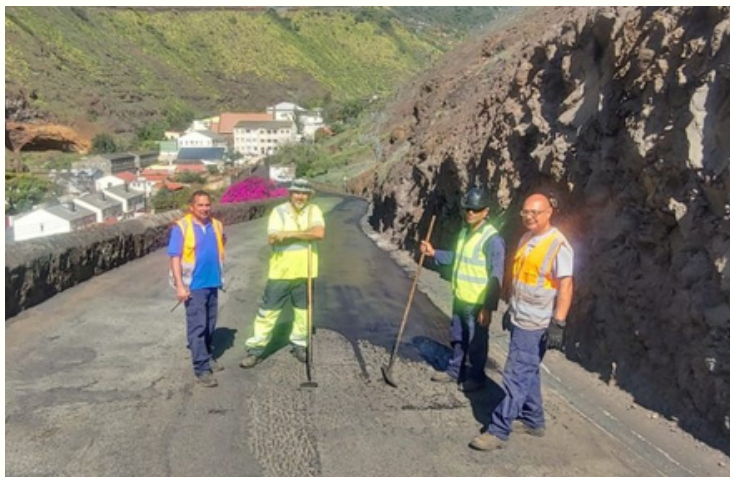
SHG ROADS SECTION

St Helena Government (SHG) will continue to keep the public informed as further roadwork plans are developed and rolled out. The Roads Section appreciates the community's patience and cooperation as work continues, and remains committed to delivering quality improvements that benefit everyone.