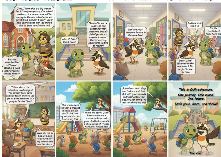
“CAPTAIN THRIVE AND THE NEW SCHOOL ADVENTURE”