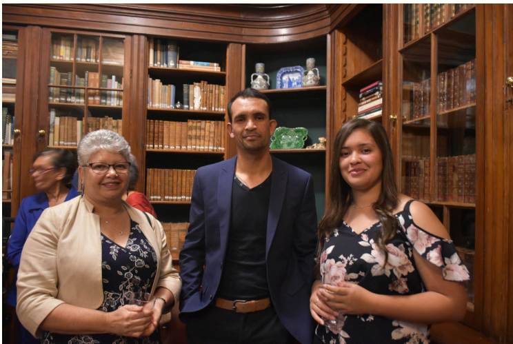
ATTENDEES OF RECEPTION