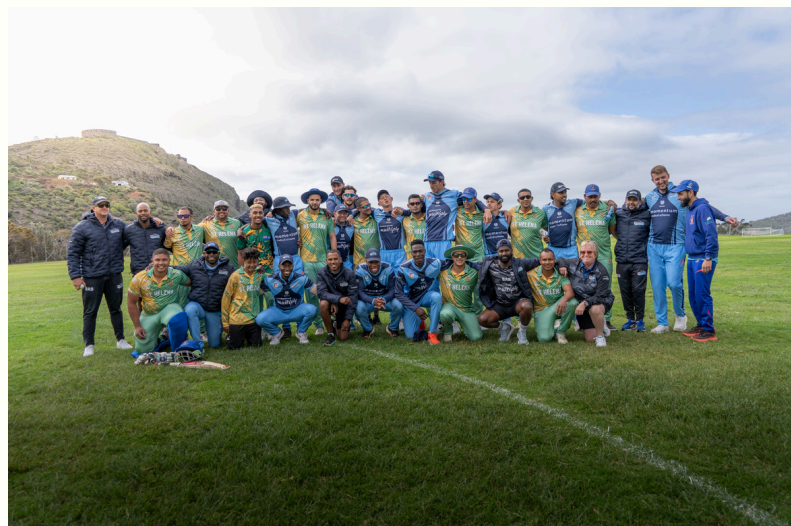
TITANS AND ST HELENA CRICKET ASSOCIATION