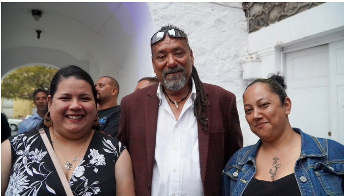
ATTENDEES OF EVENT