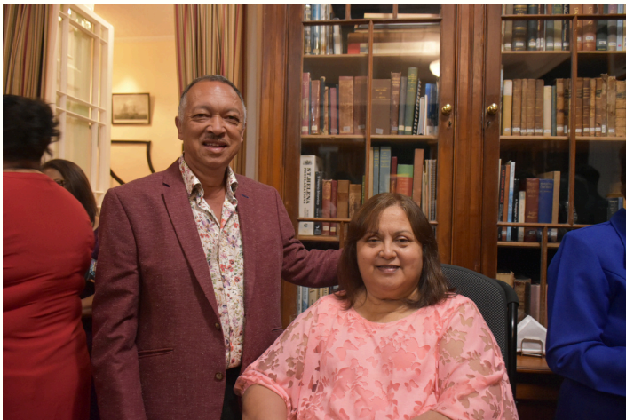
ATTENDEES OF RECEPTION

The evening provided a chance for attendees to connect, share ideas, and reflect on the value of community collaboration. It was a simple but meaningful gesture of thanks to those who help make the island a better place.