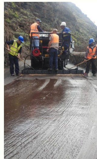
LAYING OF BITUMEN ON LADDER HILL ROAD

SHG Comms Hub | 1st Floor, The Castle | Jamestown | Tele: +290 22470