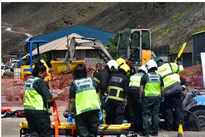
MULTI AGENCY DEMONSTRATION

The event was well received and offered a practical look at the roles and responsibilities of St Helena's emergency services.