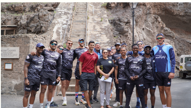
TITANS AND NSASH ASSOCIATION

The Titans also took time to explore the island, joining tours that showcased St Helena's unique history, breathtaking landscapes, and welcoming community spirit. Beyond sports, they generously shared their expertise by working with the New Horizons youth programme. Their sessions introduced young people to new skills, techniques, and approaches, giving them valuable insights and encouragement to continue developing their talents both on and off the field.