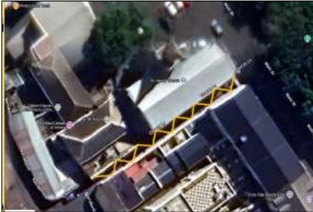
Diagram 2: Site Plan Showing Position of Light Strings

The applicants propose that the fixing options will be as follows: