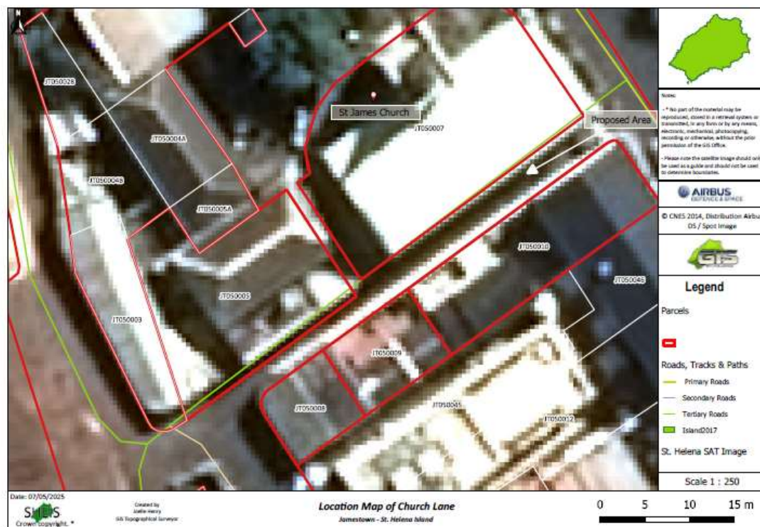
Diagram 1: Location Plan

The proposal would be in part attached to St James Church – Grade I Listed, HM Prison (The Old Gaol) – Grade II and of Group Value and The Mantis Hotel – (Staff House) – Grade II and residential properties to the rear of The Mantis fronting onto Church Lane, Lower Jamestown. It is designated within Intermediate Zone as well as the Heritage Coast Conservation Area – St James Church, HMP Prison, The Archway/Church Road – and Jamestown Historic Conservation Area – The Mantis and Residential Properties to the south.