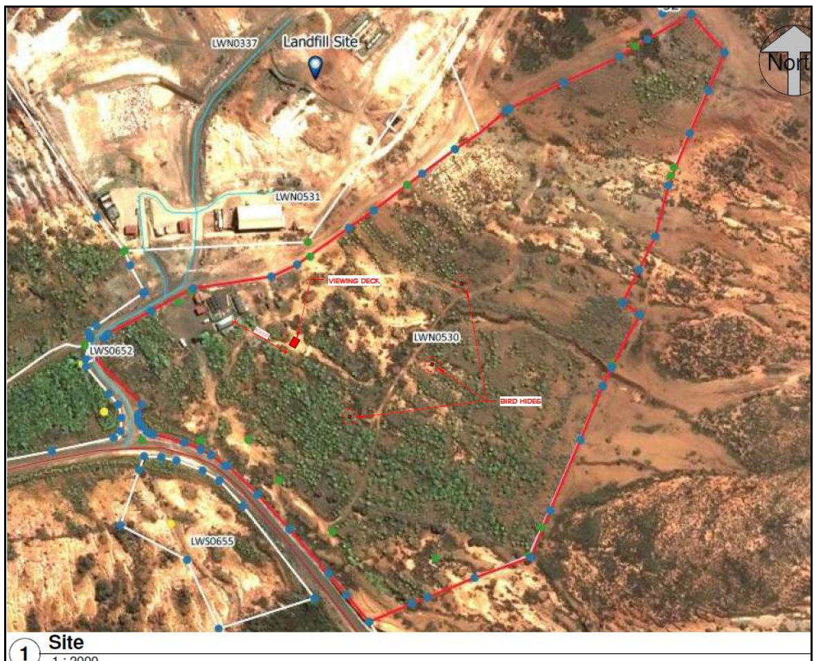
Diagram 1: Site Layout

This development will be carried out within the Millennium Forest Conservation Area, designated within the Coastal Zone.