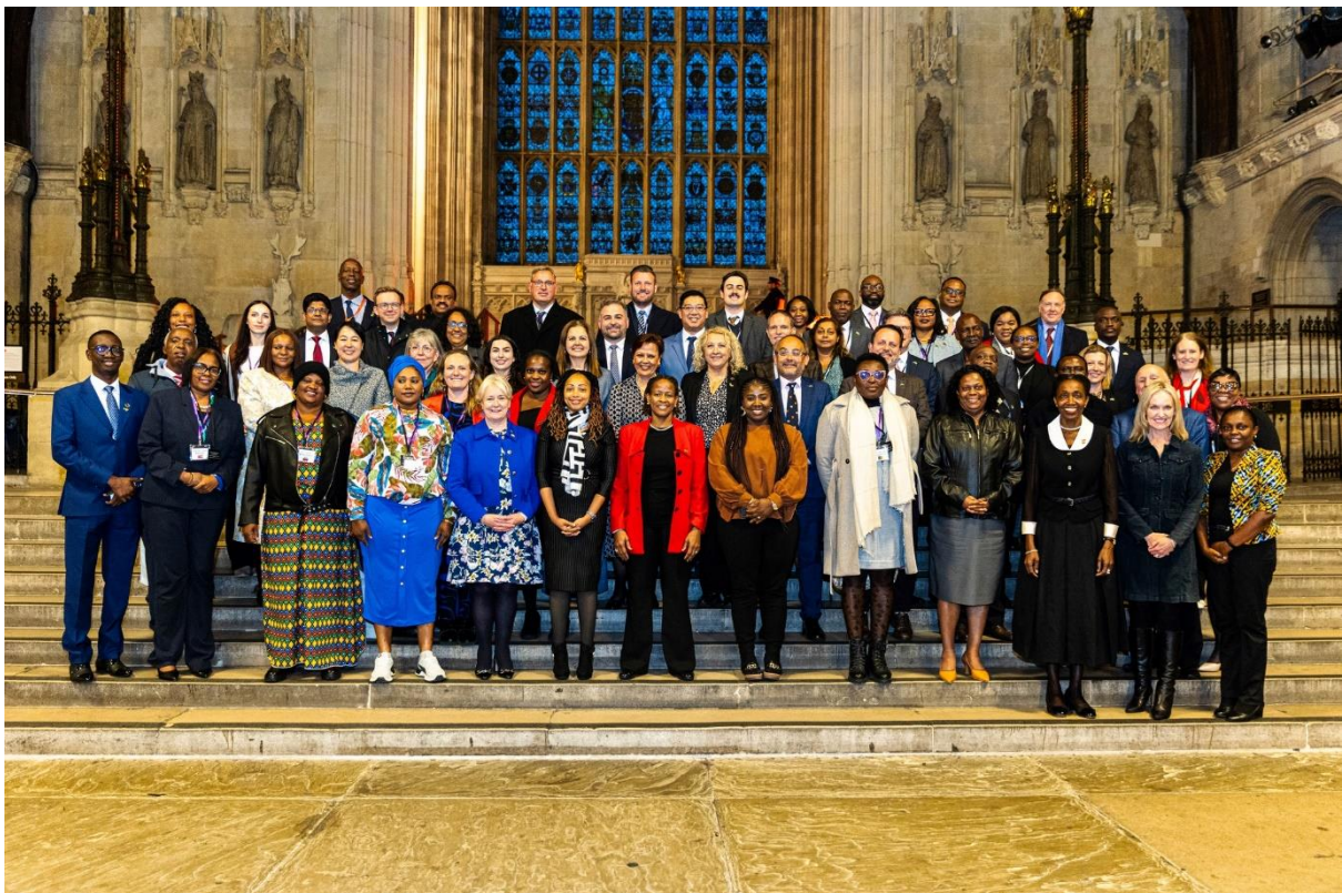
Attendees of the 72 nd Westminster Seminar on Effective Parliaments