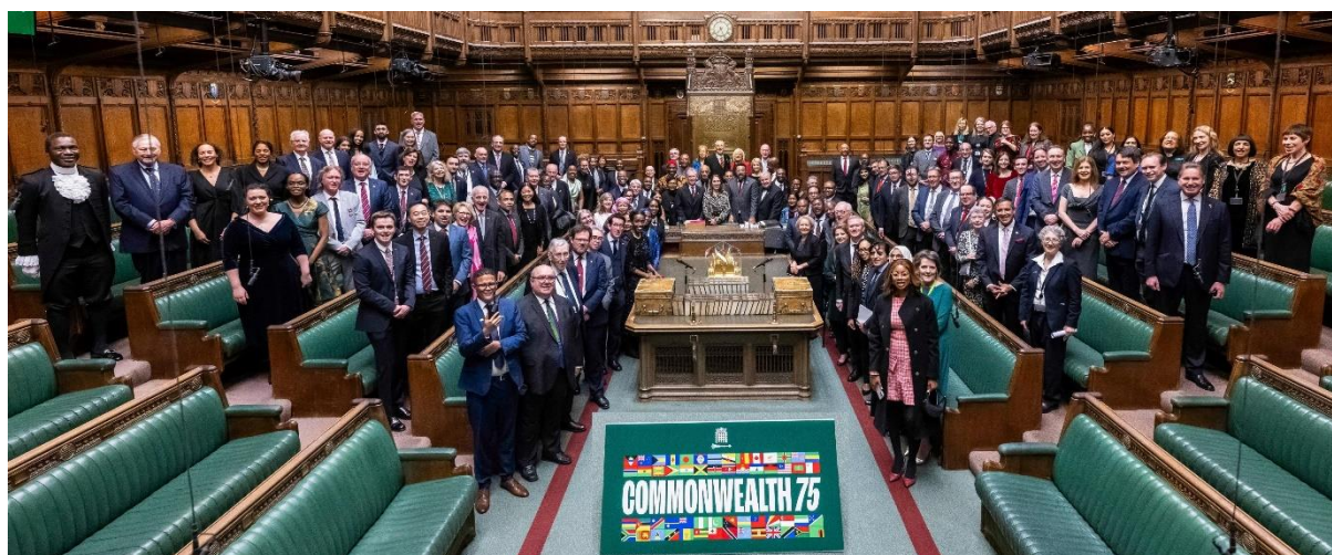
Attendees in the House before the reception dinner.

The anniversary reception and dinner were genuinely unique experiences, and they were one of the highlights of an incredible week. The reception was held at the Speaker's House in the Palace of Westminster, and the dinner was in the central lobby of Westminster. Delegates from various occupations attended the events, including ambassadors, Lords members, MPs, and overseas representatives.