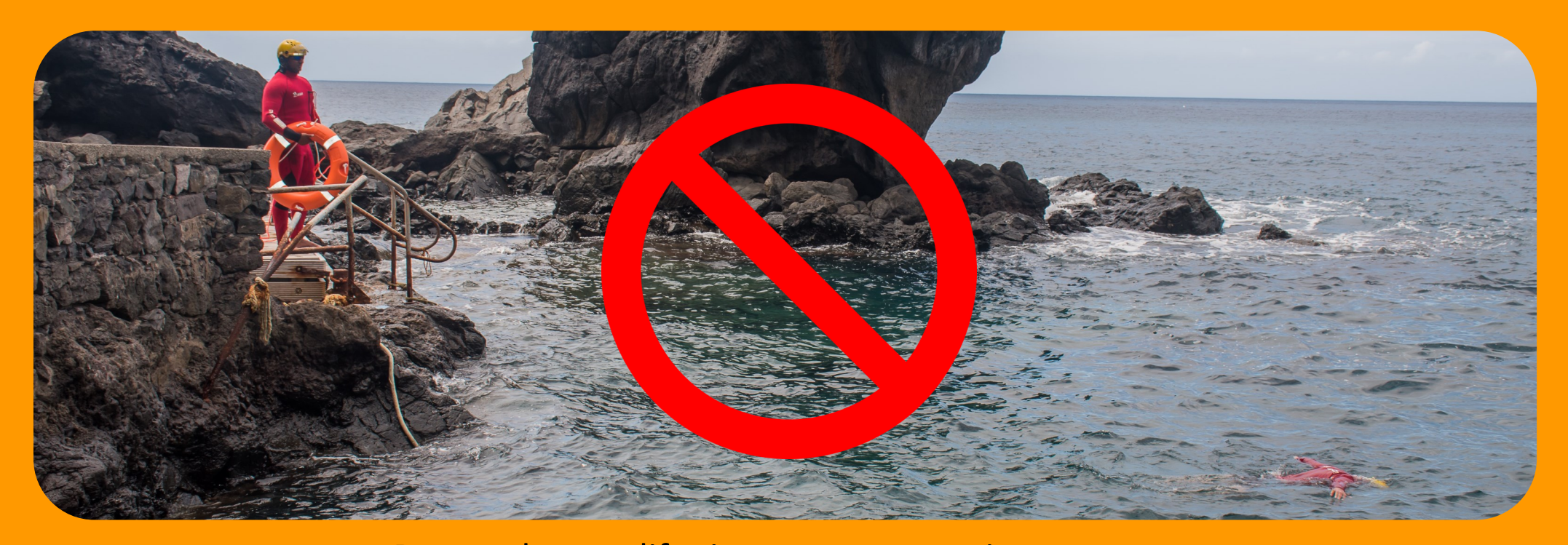
Do not throw a life ring to an unconscious person.