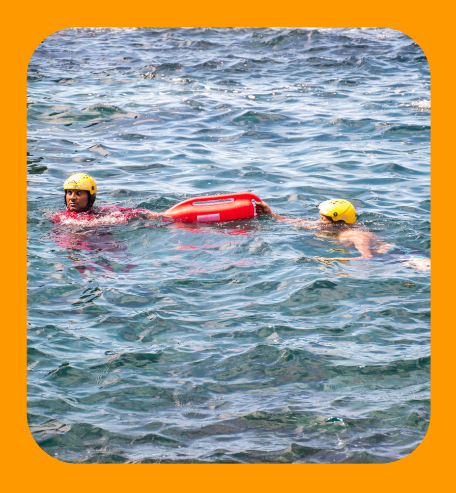
You MUST ensure that you position the buoy between yourself and the casualty, if not the casualty will instinctively grab you and could drown you.