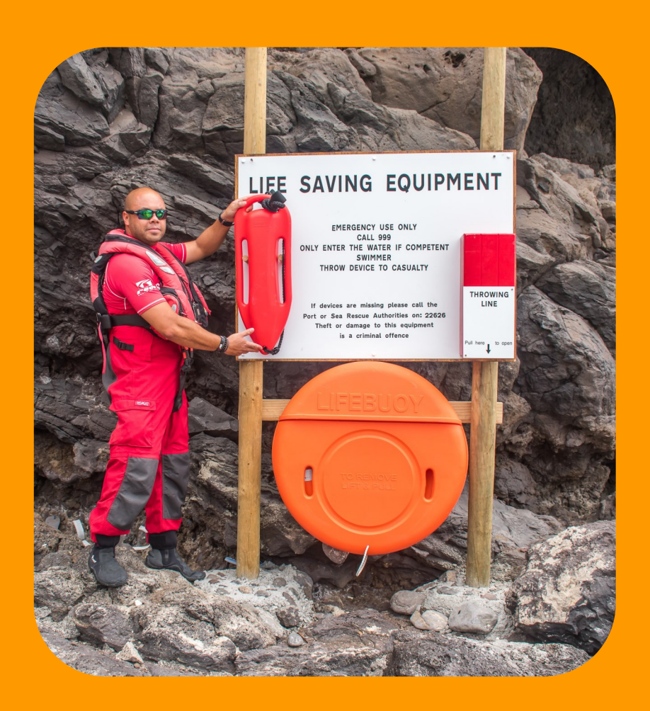
This is a 'torpedo buoy'. Remove it from the board.