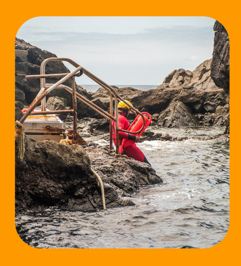
As a <u>last resort</u>, and if and only if you are a competent swimmer and are aware of the potential risks, attach the strap and enter the water.