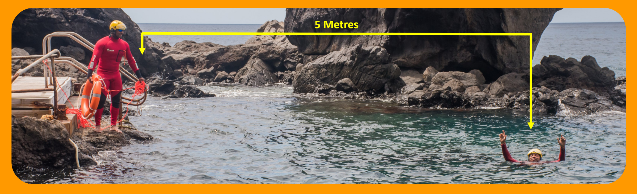
Position yourself ensuring good footing. Be careful not to hit the swimmer with the ring.