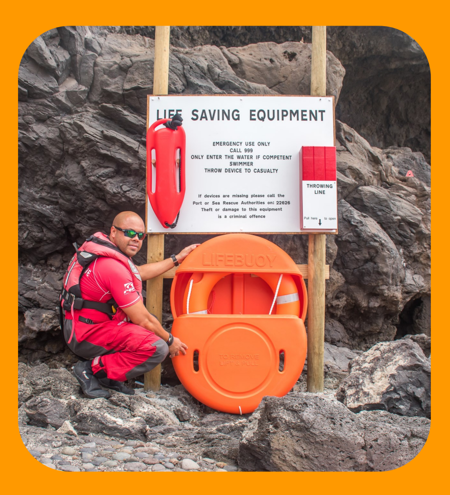
Remove the lid and remove ring as shown.