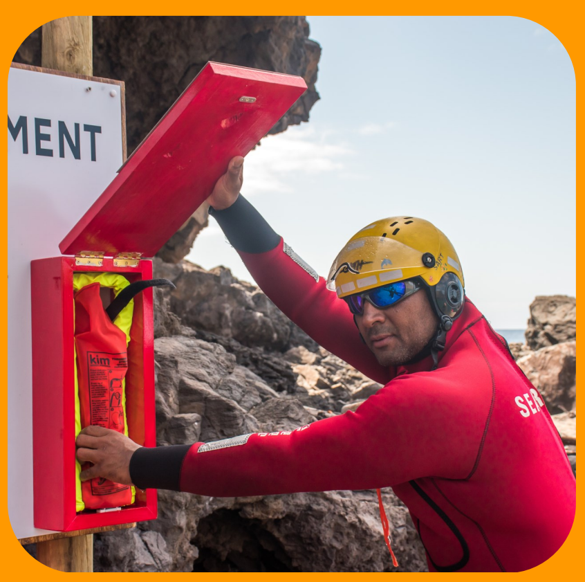
Lift the cover and remove. Instructions are printed on the device.

It is best used for providing assistance to casualties further from the shore.