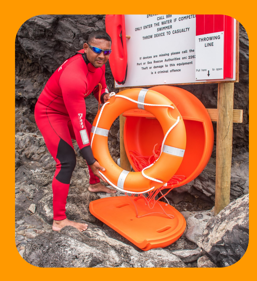
This is a 'life ring'. It is used when a swimmer in difficulty is within 5 metres of the shoreline.