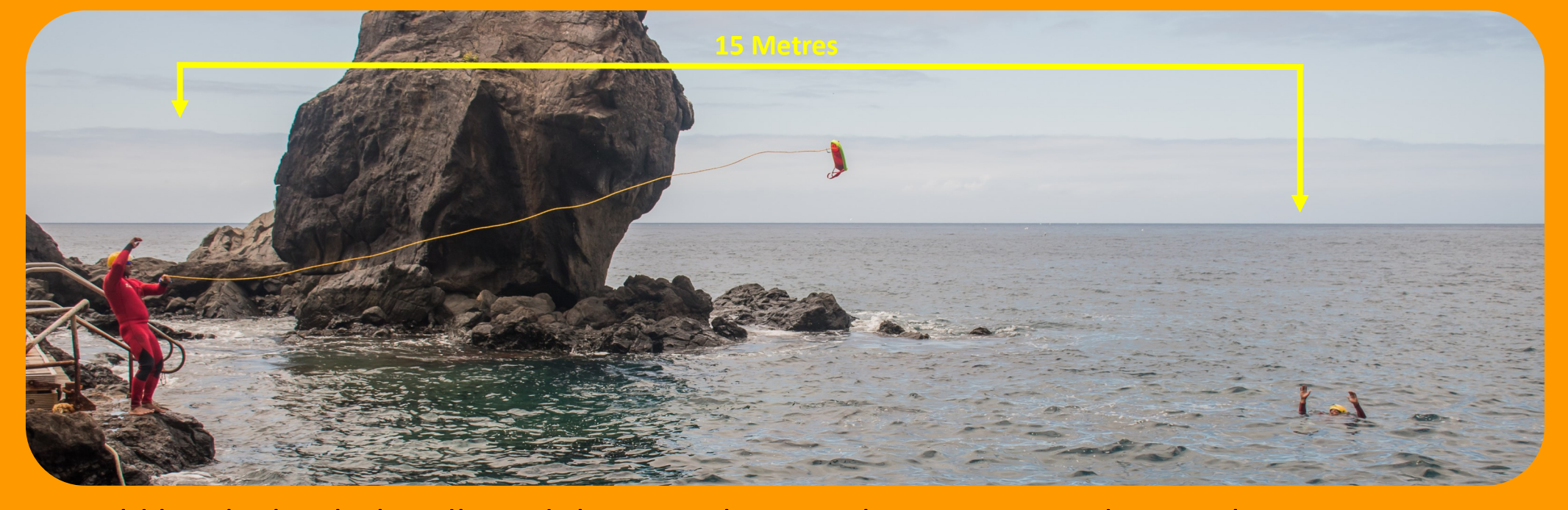
Hold line by bright handle and throw to the casualty using an underarm throwing motion.