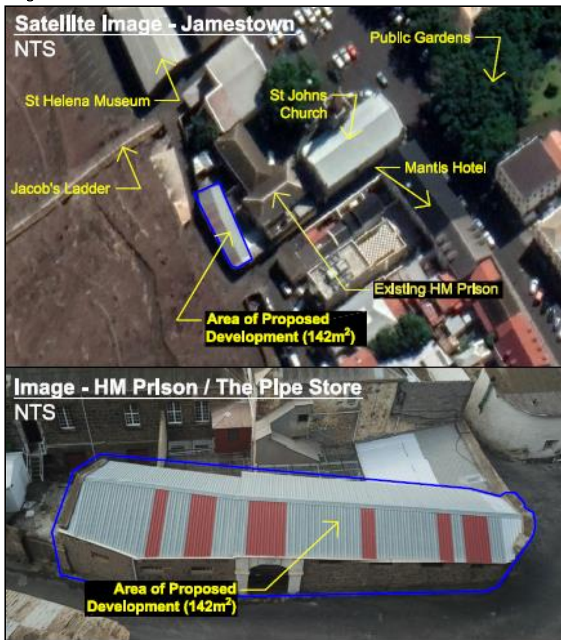
Diagram 1: Location Plan

The development will be carried out at the Pipe Store building, located next to the HM Prison in Jamestown, where it is designated within the Intermediate Zone and Jamestown Historic Conservation area.