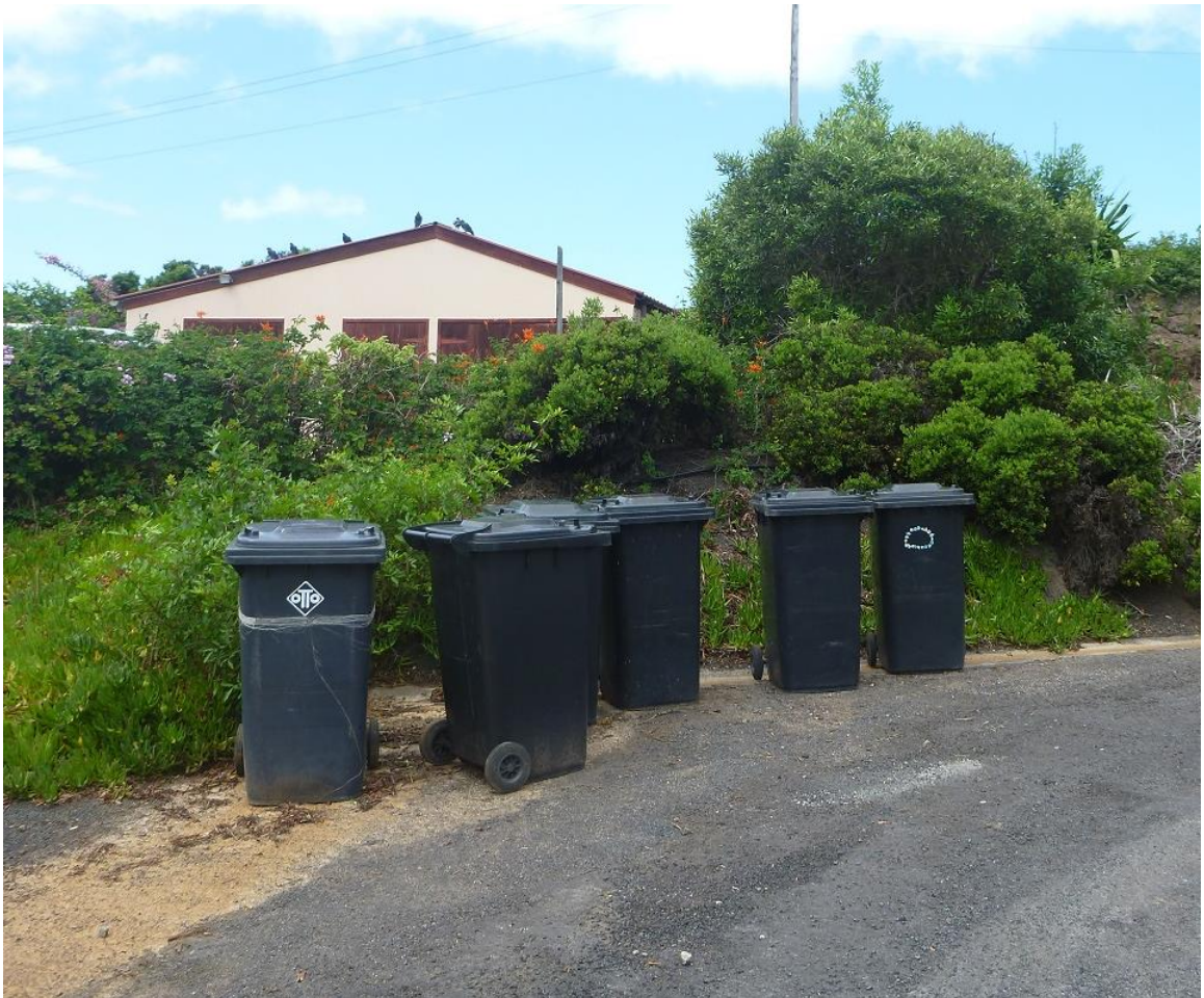
Diagram 3: Photos of the Site after the Communal Bin Enclosure was constructed