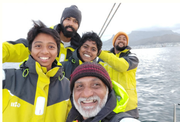
Crew of Tarini in Cape Town, South Africa

St Helena's popularity as a port of call is popular for sailing yachts, a large number of which stop here every year. A safe haven awaits in an unspoilt conveniently positioned destination in the South Atlantic.