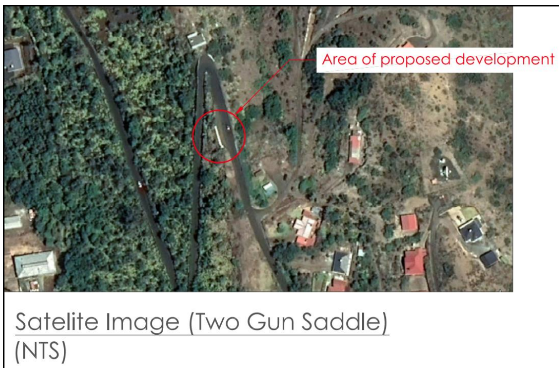
Diagram 1: Location plan

The development site is located at Two Gun Saddle. The bus shelter platform will be sited on the road side within the southern corner of the existing viewing platform. The development falls within the Intermediate Zone with no Conservation Area restrictions.