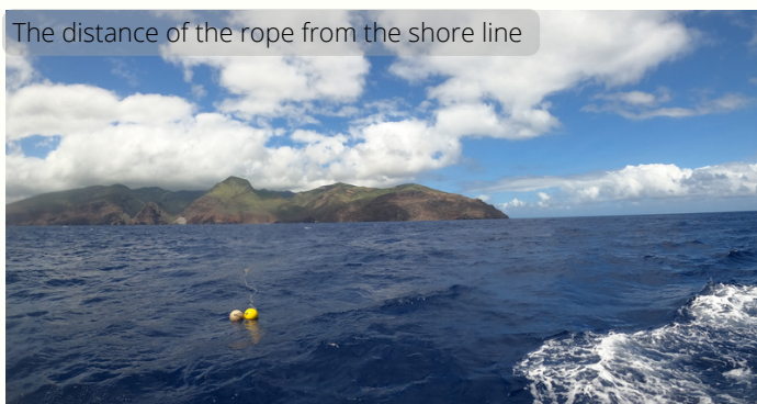
The distance of the rope from the shore line