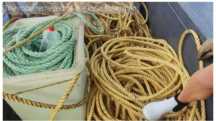
The rope retrieved by the local fisherman