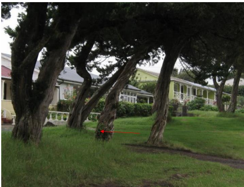
Diagram 1: Tree for Removal

Recommendation is to remove the tree that is heavily leaning towards the designated access to the residential property.