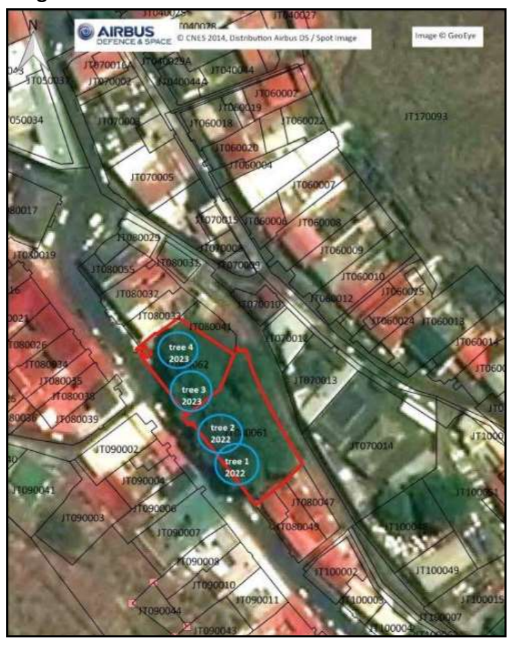
Diagram 1: Location of Trees

ASSESSMENT OF THE TREES AND PROPOSED MAINTENANCE WORKS (Extracted from Forestry Officers Assessment)