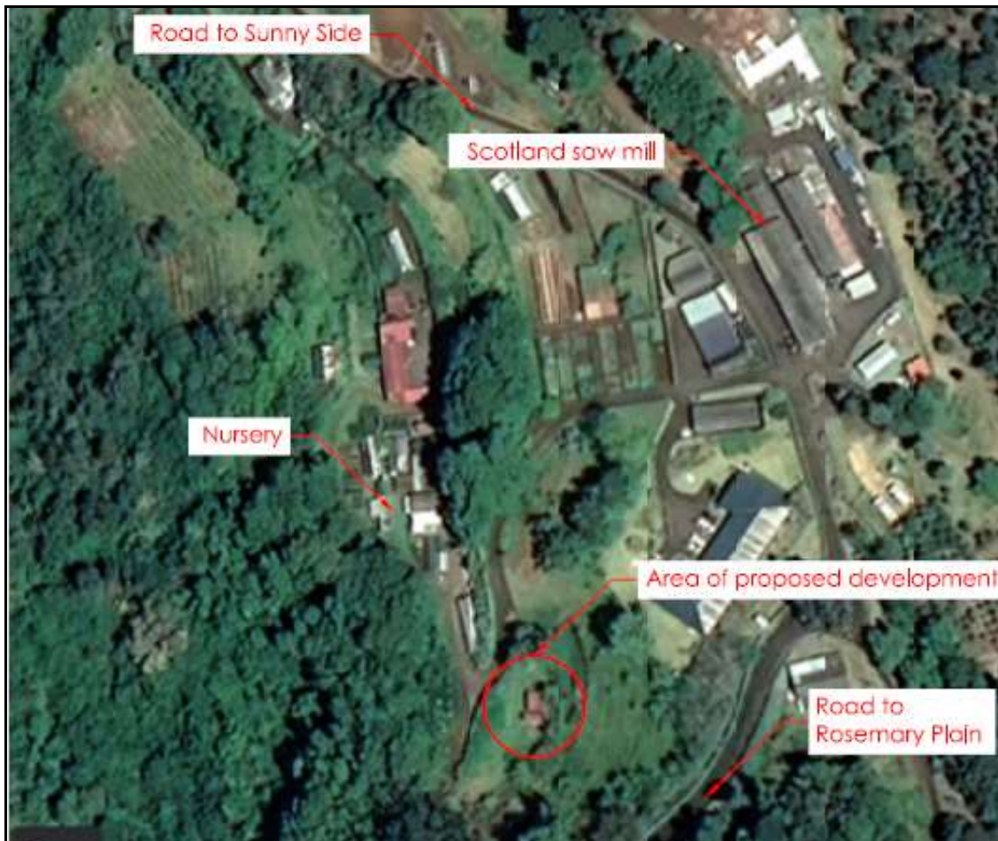
Diagram 1: Location Plan

The application site is located within the Scotland Complex in St Pauls, where the land is within the Intermediate zone with no Conservation area restrictions.