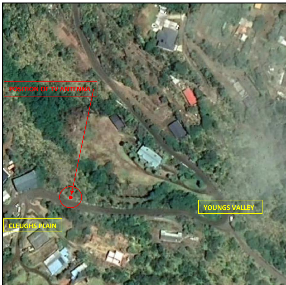
Diagram 1: Location Plan

The application site is situated on vacant crown land below the main road near Cleughs Plain point. Crown Estates have given the applicant permission subject to planning approval.