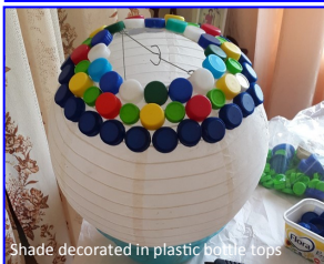
Shade decorated in plastic bottle tops