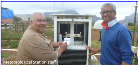
Meteorological Station staff