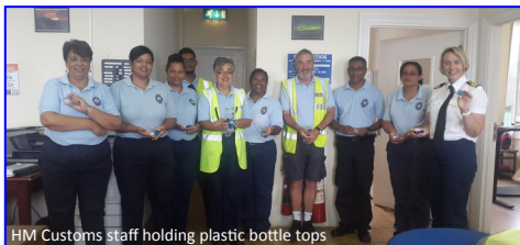
HM Customs staff holding plastic bottle tops