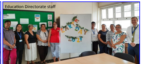
Education Directorate staff