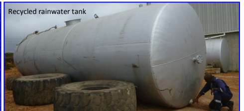
Recycled rainwater tank