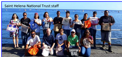
Saint Helena National Trust staff