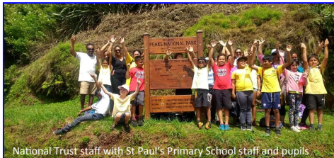
National Trust staff with St Paul's Primary School staff and pupils