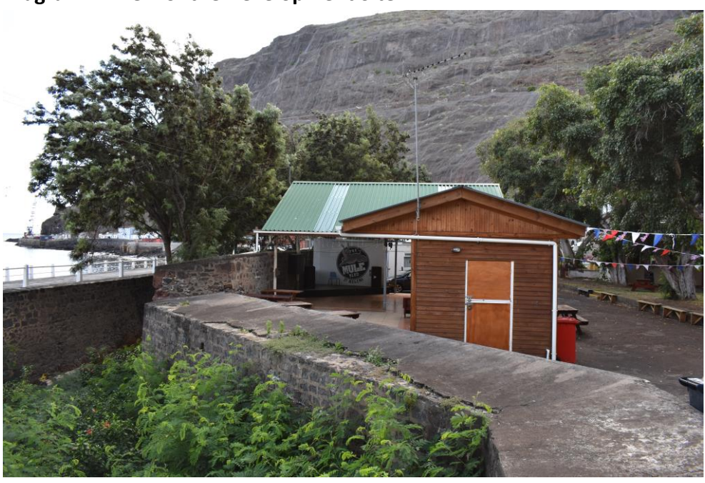
Diagram 4: View of the Development Site

From the assessment of the plans that were approved in 2009, it appears that only some of the development has taken place in accordance with the plans that were submitted, however some of the proposals have altered and others have not been completed. Over the past nine months, there have number of discussions with the officers in Crown Estate and Property Services and more recently with the new lessee and operator of the venue to agree a way forward and this has resulted in the submission of this development application to seek retention of the structures that were erected and to continue the use. The continued use of this area for entertain and leisure fall within wider aspirations of the Jamestown Seafront area and the venue remains popular with the local people and through an agreed approach with the grant of development permission, opportunity can be afforded regenerate and enhance these facilities and the wider area.