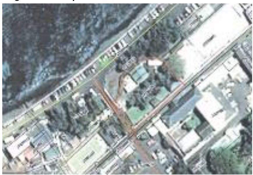
Diagram 1: Locality

The development site is an open area north of the Castle wall and the moat on the Jamestown sea front. The whole of this area is historically and environmentally important with the Fortifications that provide the background to the Island and Jamestown. This whole area is Grade I listed and within the Heritage Coast Conservation Area. The application site is within the Intermediate Zone.