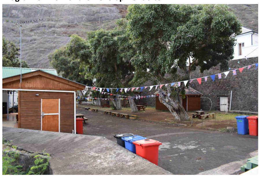
Diagram 3: View of the Development Site