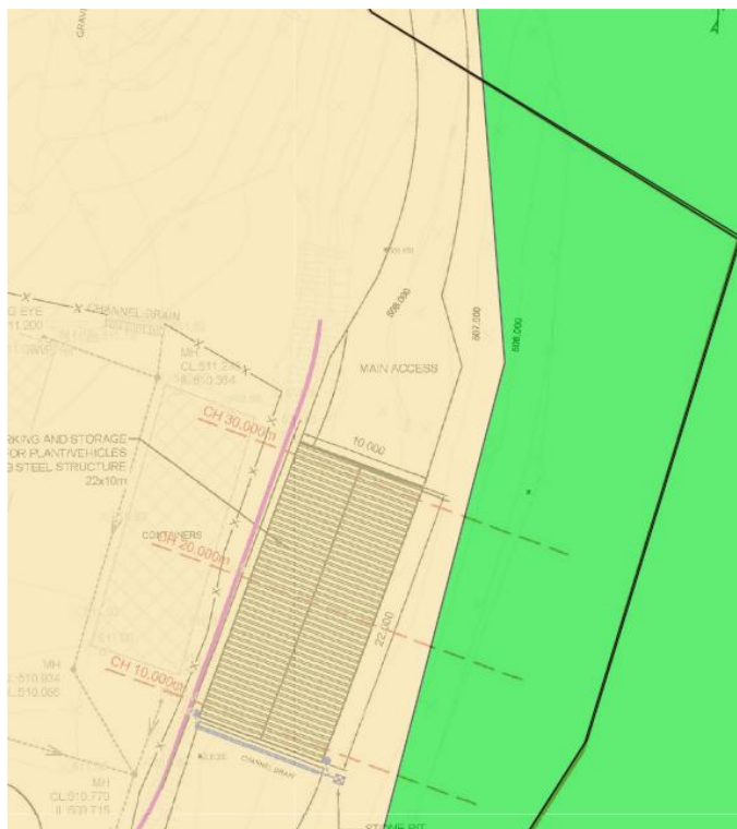
Diagram 3: The Revised Layout and Green Heartland Zone Boundary

As part of the Revised Land Development Control Plan, there are proposal to revise Zone boundaries. Any revision of the Zone boundary will only be of legal status once the Revise Development Plan has been adopted following public consultation and examination. The revised development plan is at present in early stage of formulation