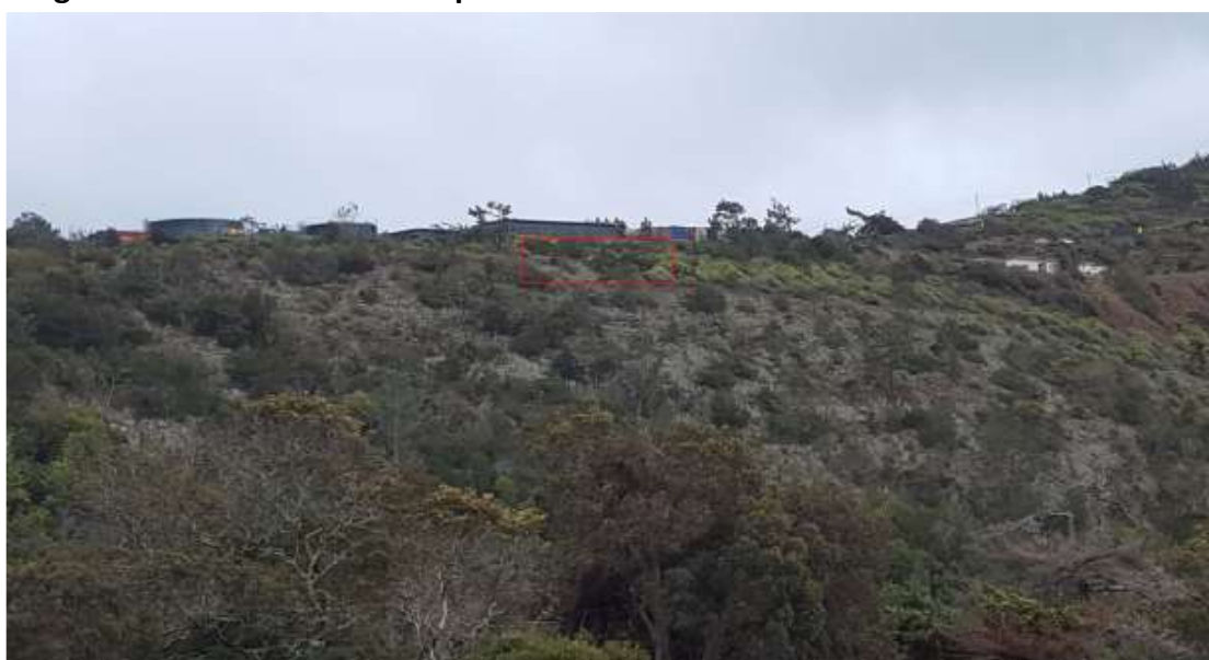
Diagram 6: View in the landscape

There is probably no overall plan for the future direction of development for this site, however, as this proposal was part of the earlier development application, it appears that there has been some thought on the need assessment of the operation and how this can be met. Following concern from the planning officers on the proposal and subsequent discussion to review alternative options, the applicant has given thought to the overall in the planning of the site.