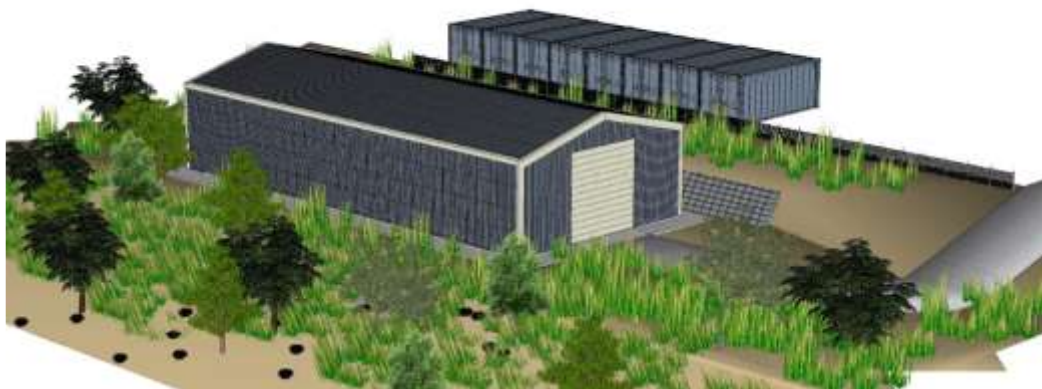
Diagram 5: Diagrammatic Perspective of the development

There will be stone pit soakaway to dispose of the stormwater from the roof of the container