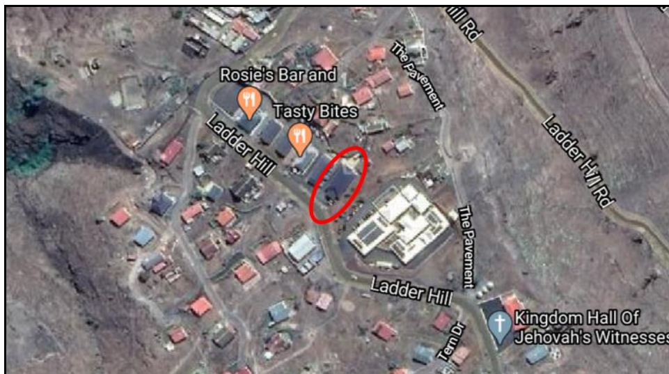
Diagram 1: Location of Proposal

The request is to undertake the proposal on the Printech Building at Ladder Hill, situated directly beneath the Community Care Centre and just above the Enterprise St Helena Office. The site falls within the Intermediate Zone and proposed Heritage Coast Conservation area.