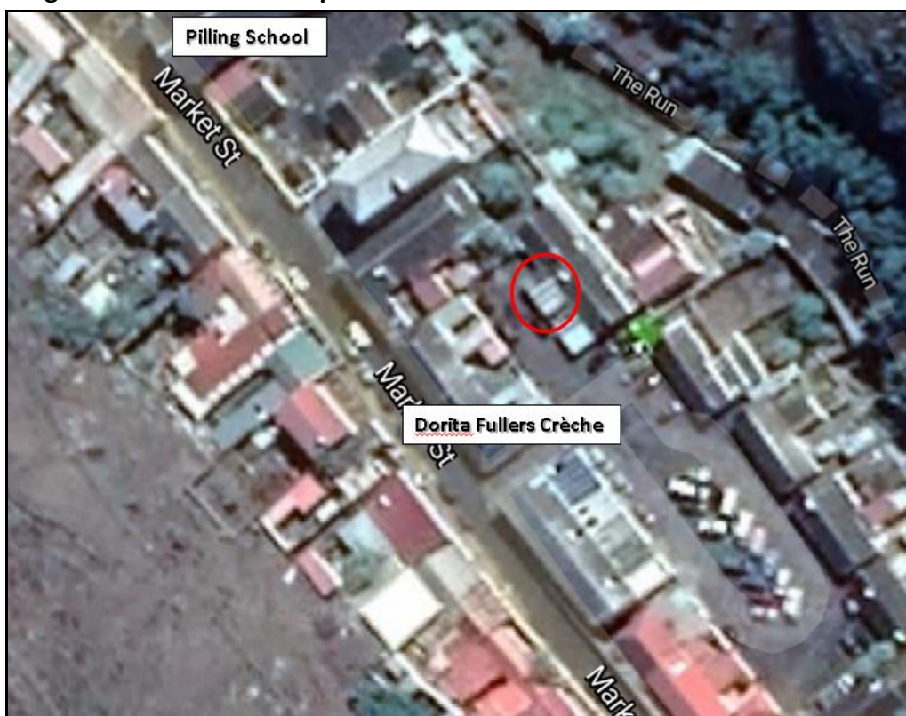
Diagram 1: Location of Proposal

The application site is situated within the Barracks Square area of Jamestown. The site is located within the Intermediate Zone and the proposed designated Jamestown Conservation Area.