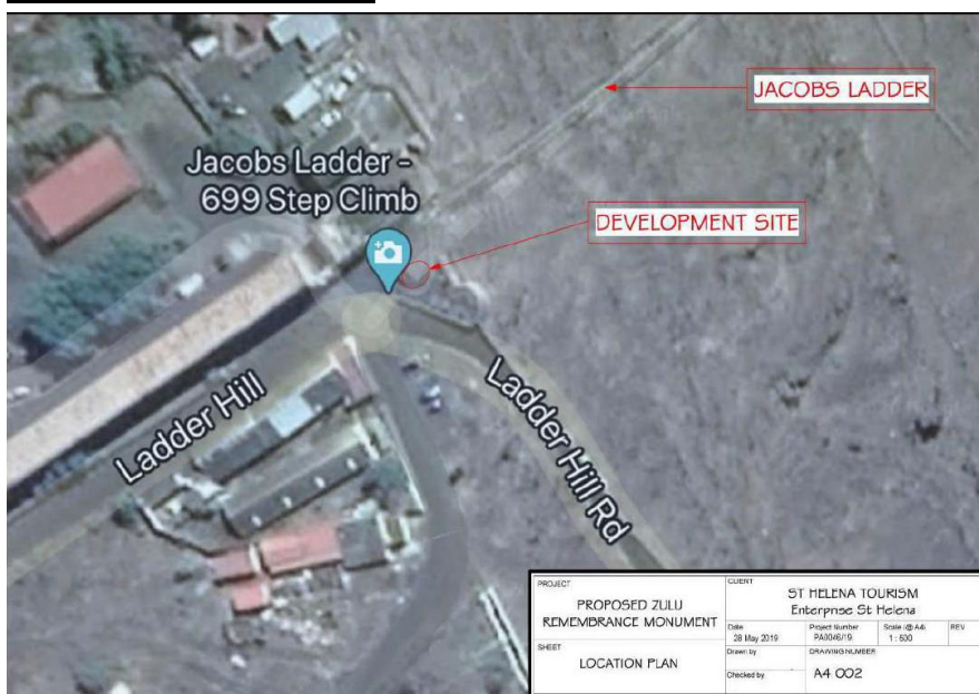
Diagram 1: Location Plan

Location: The monument will be located at the view platform at the top of the Jacob's Ladder that has been developed as an area for tourist attraction. The site is part of the conservation area at the Ladder Hill Complex. The application site is within the Coastal Zone Conservation Area .