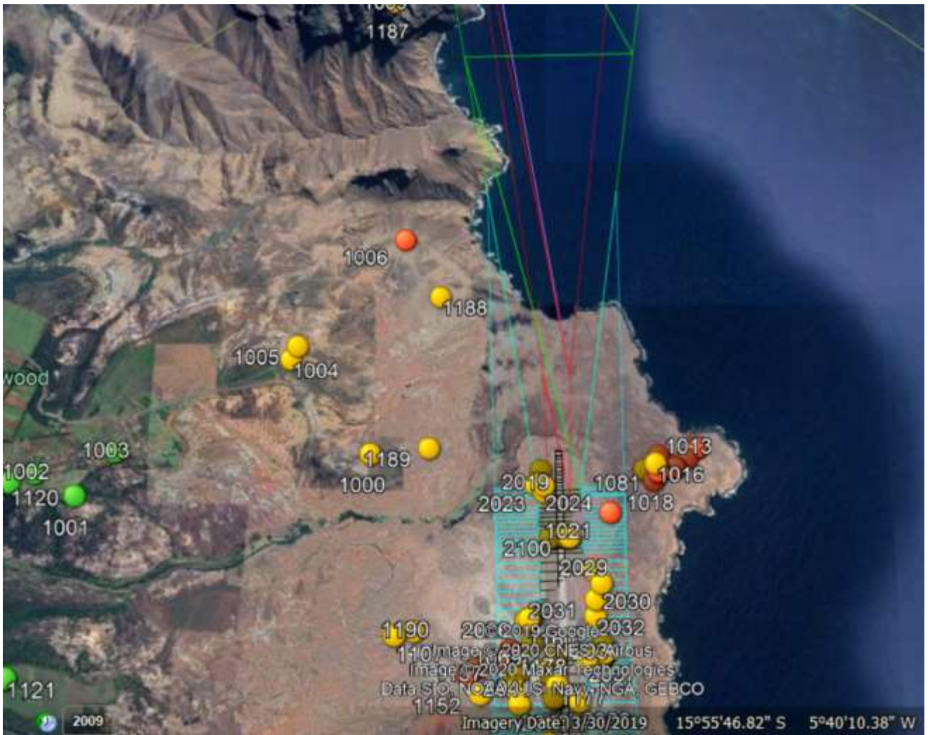
Figure 5 - Wedge shaped area originating at the departure and arrival end of the runway and extending for 3 nautical miles from the runway over which the aircraft would normally track.