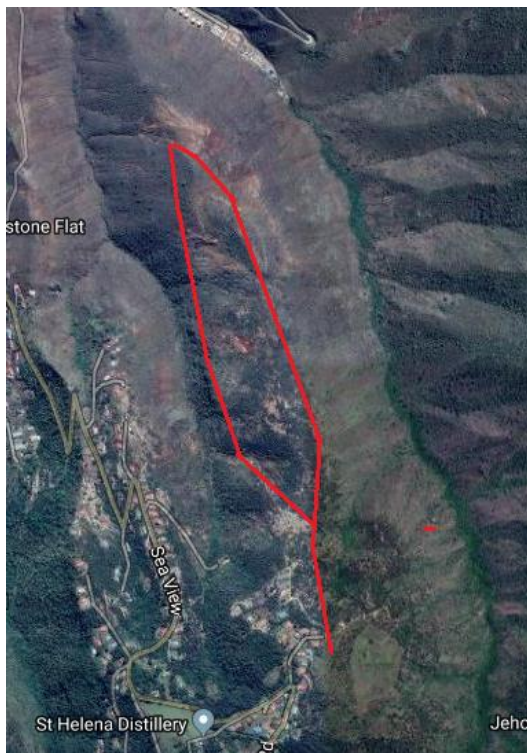
Diagram 1: Location Map

The applicant was encourage to submit a hybrid planning application in respect of this development proposal as it was considered necessary and appropriate to deal with number of important detailed development issues which should be firmed-up at the early stage of the development process, such the access road to the site, the internal estate lay-out and in particular the location of the other uses, amenity space and how the development of the individual housing plots would be laid out to ensure that the volume of housing could be laid out and delivered.