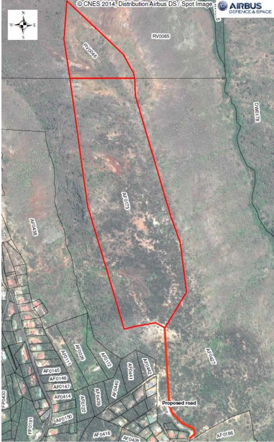
Diagram 2: Development Application Site

parcel is in Rupert's Valley district. This is a narrow linear site stretching from Alarm Forest to Rupert's Valley, approximately 1.7km in length north-south and approximately 250m at the widest point east-west. The land is allocated in the LDCP for up to 150 housing units and will require an access road to enable future development.