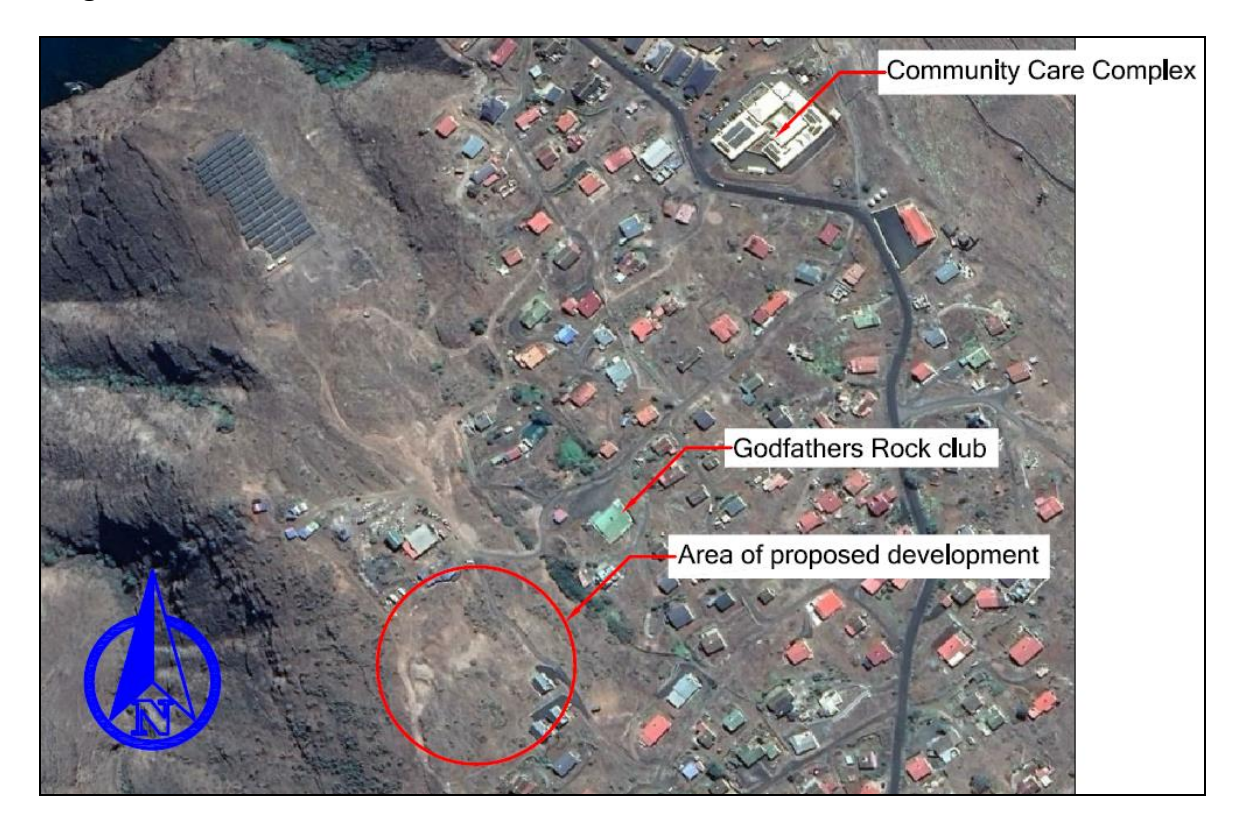
Diagram 1: Location & Orientation

The development site is situated above Ambledale Workshop and is located within the Intermediate Zone and has no conservation area restrictions.