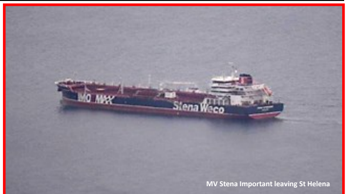
MV Stena Important leaving St Helena

The vessel was built in 2015 and has a Gross Tonnage of 29666.