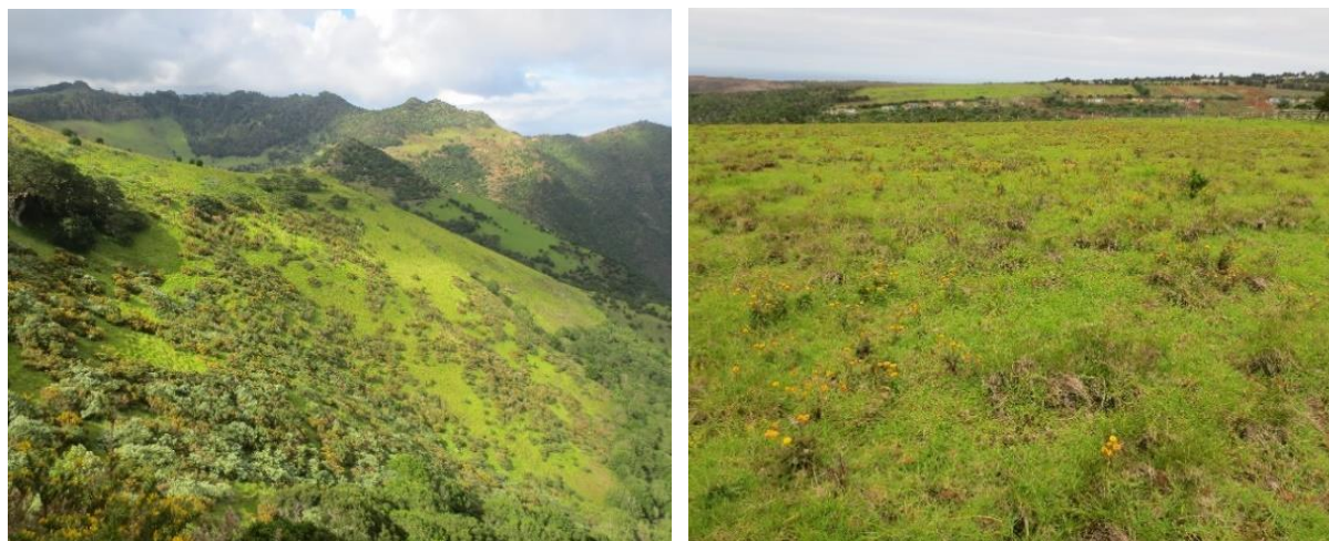
Figure 6 & 7: Weed infested pasture land at Southwest Point (left) and Deadwood Plain.

Some areas of St Helena’s pastureland have major weed problems (Figures 6 & 7), with Whiteweed, Furse, Bull Grass and Junipers four of the most abundant. In some areas there is little Kikuyu grass left (i.e. the grazed species). There are methods employed on St Helena to control weeds in pasture land, but ANRD believe more could be done by some of the syndicates to control weeds and they would benefit from additional knowledge.