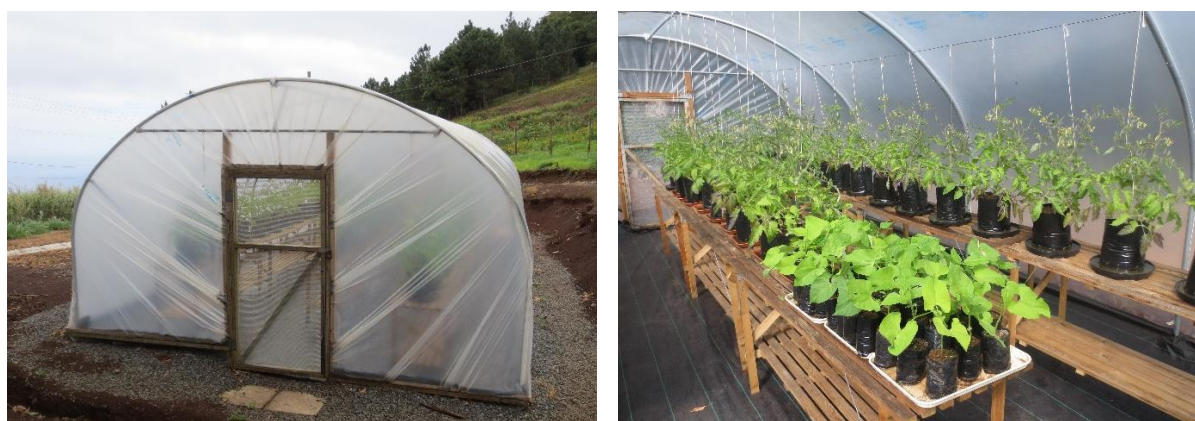
Figure 10 & 11: The ANRD facility at Scotland for the breeding of parasitic wasps ( Encarsia formosa ).

*IPM – using multiple P&D control strategies within one-joined-up programme, with a focus on monitoring, good husbandry, cultural control methods and prevention rather than eradicant methods and high levels of pesticides.