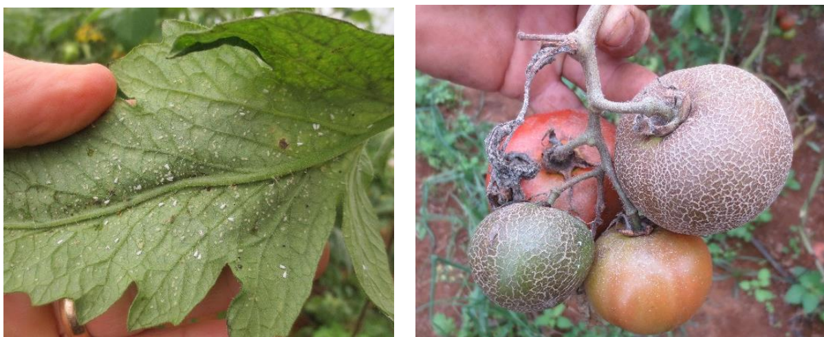
Figure 8 & 9: Heavy infestations of Whitefly (left) and Russet Mite on polytunnel grown tomato crops.

According to Jill Key, “Back in 1990s it was far worse for pesticide use on STHL, with more pesticides used, of an even lesser range. There was good progression when I returned in 2013, demonstrated by a larger grower, who had previously applied vast quantities of pesticides as his only approach, now using biological controls”.