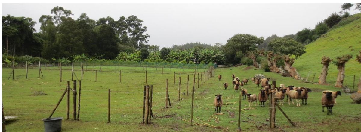
Figure 1 (top left): Longwood farmer with a plastic mulch to produce Sweet Potatoes. Figure 2 (top right): Trials in pot grown strawberry production. Figure 3 (below): A form of mob grazing in operation at Farm Lodge.