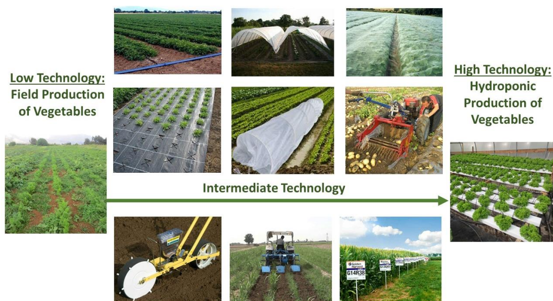
Figure 14: Crop production has developed from open field, to large-scale polytunnels, including high technology hydroponic systems. Other intermediate technologies could offer lower-cost benefits and be well suited to a Demonstration Farm e.g. irrigation, sun tunnels, crop covers & mulches, mechanisation and variety trials.

4.1.3 A wider pool of suppliers is required: The present supply of expertise, resources and products from overseas is limited. DICLA, for example, are a 'go to organisation' for ANRD and ESH for agronomy support, materials and training, and most seeds available on island come through one RSA wholesaler, Starke Ayres. Both DICLA and Starke Ayres are reputable and useful suppliers, but they are not the whole picture.