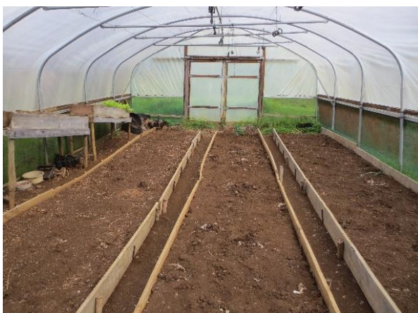
Figure 12 & 13: The Harper’s agricultural training facility at Prince Andrew’s School: Fig 12 (left) the excellent and well-equipped classroom building and veranda area; Fig 13 (right) the polytunnel used for training.