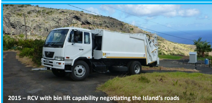
2015 – RCV with bin lift capability negotiating the Island's roads