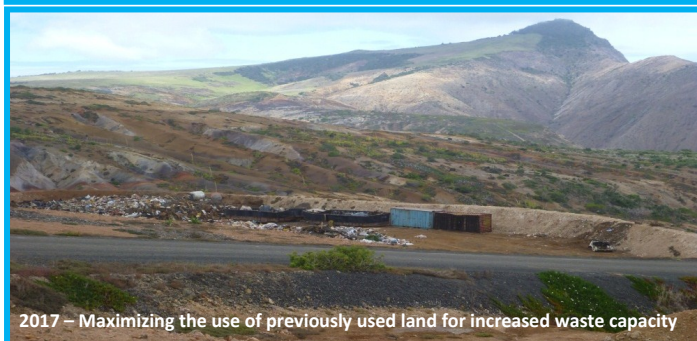
2017 – Maximizing the use of previously used land for increased waste capacity