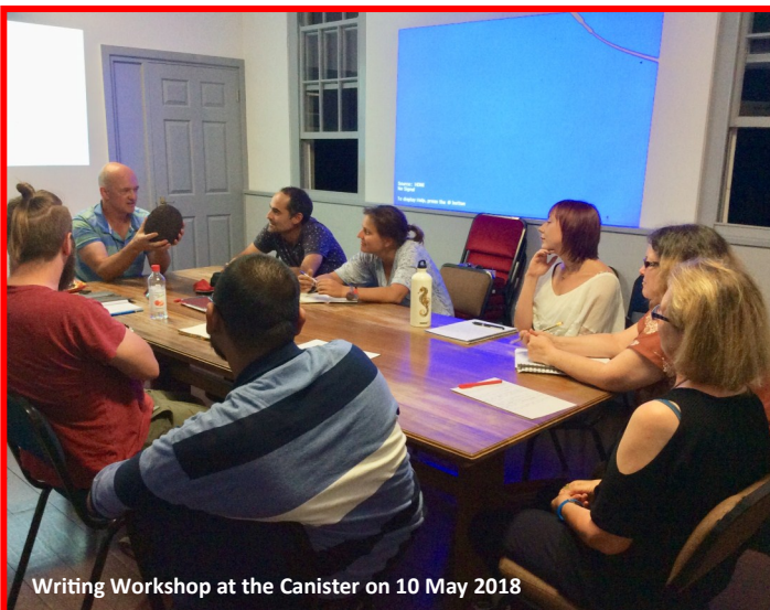
Writing Workshop at the Canister on 10 May 2018