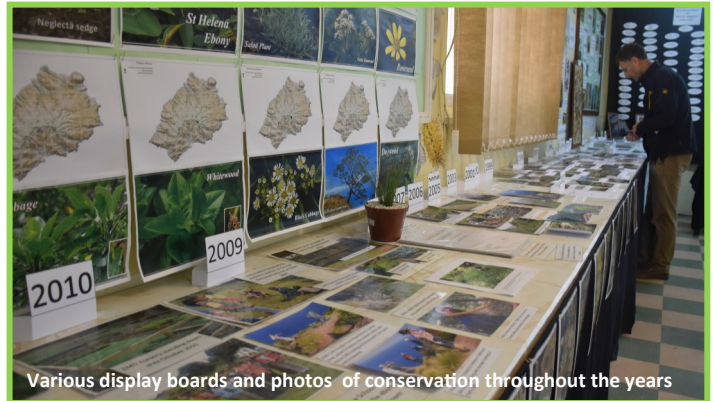
Various display boards and photos of conservation throughout the years