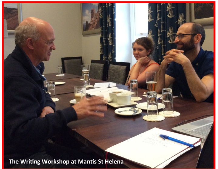
The Writing Workshop at Mantis St Helena

"As a child I wrote short stories about King Neptune and his mermaid and posted them into a post box made from a washing-up liquid bottle for my mother to collect and read. Later, after travelling to Africa I tried writing travel articles and found they got accepted. I went on a writing