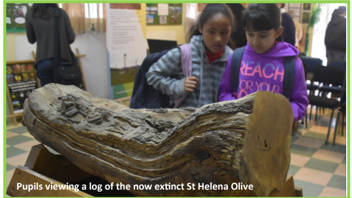
Pupils viewing a log of the now extinct St Helena Olive