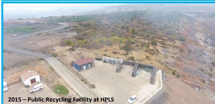
2015 – Public Recycling Facility at HPLS