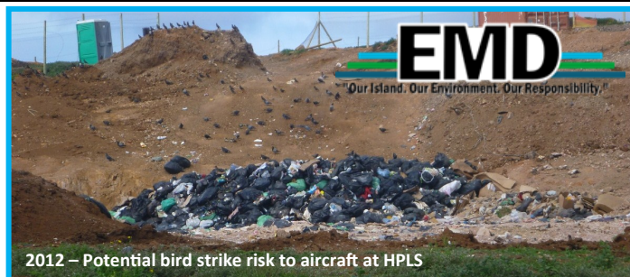
2012 – Potential bird strike risk to aircraft at HPLS

WMS, working in partnership with the Marine Section and the Saint Helena National Trust Marine Team and SHAPE, will deliver a project entitled: 'Sustainably manage plastic waste on St Helena to minimise marine debris'. This project, which is externally funded through the UK Government's Department for Environment, Farming & Rural Affairs (DEFRA), aims to: establish a marine debris monitoring programme along St Helena's coastline, monitor the use of single use plastic on-Island and how much of this enters St Helena's waters, raise awareness of marine debris and its negative impact and locally manufacture plastic recycling equipment. In support of the project, WMS have engineered a new waste bay into the Public Recycling Facility at HPLS for the disposal of mixed plastic waste. They will also be locating new light grey wheelie bins for plastic waste across the Island, alongside existing red bins for glass and blue bins for cans recycling, and implementing a recyclable waste collection service.