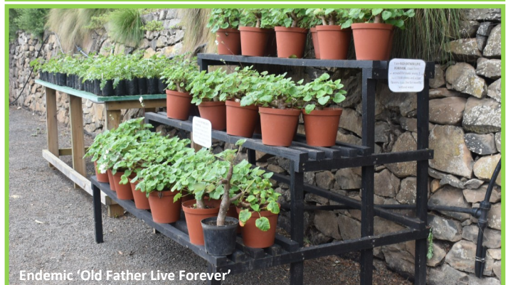
Endemic 'Old Father Live Forever'