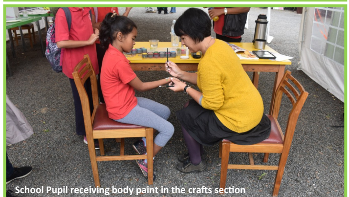
School Pupil receiving body paint in the crafts section