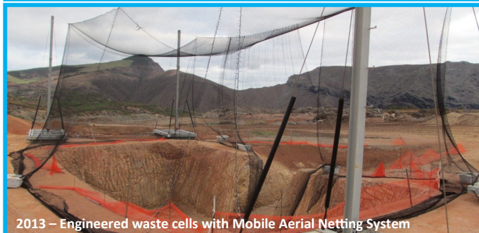
2013 – Engineered waste cells with Mobile Aerial Netting System