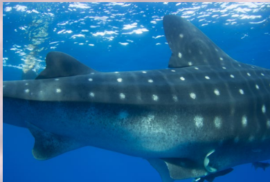
Female whale shark - potentially pregnant