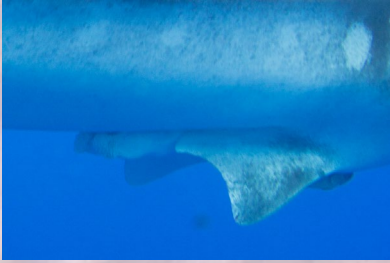
Male's have claspers for reproduction