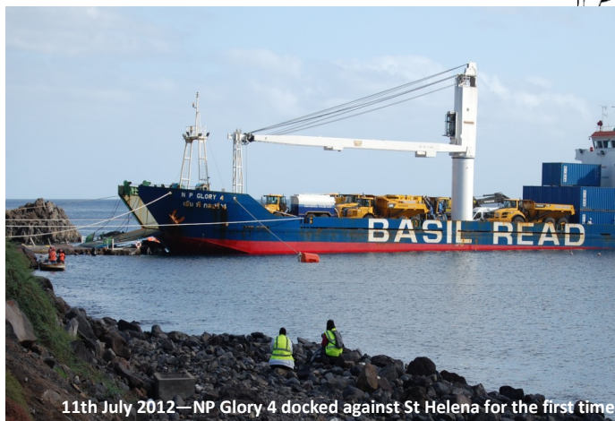
11th July 2012—NP Glory 4 docked against St Helena for the first time