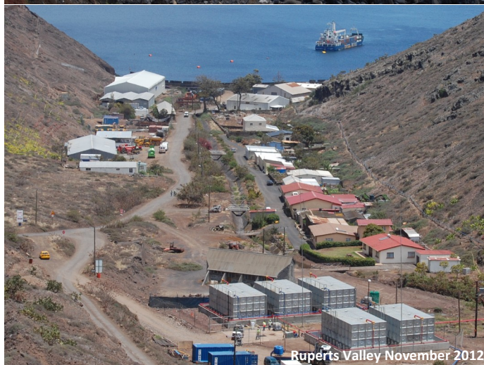
Ruperts Valley November 2012