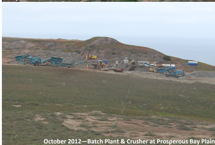
October 2012—Batch Plant & Crusher at Prosperous Bay Plain