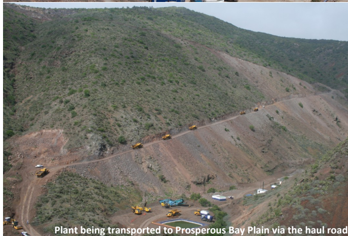
Plant being transported to Prosperous Bay Plain via the haul road