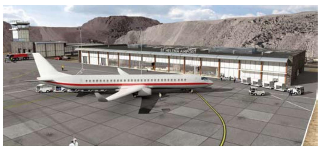
Figure 3 Artist's Impresssion of Airport Terminal with B737-800 Aircraft