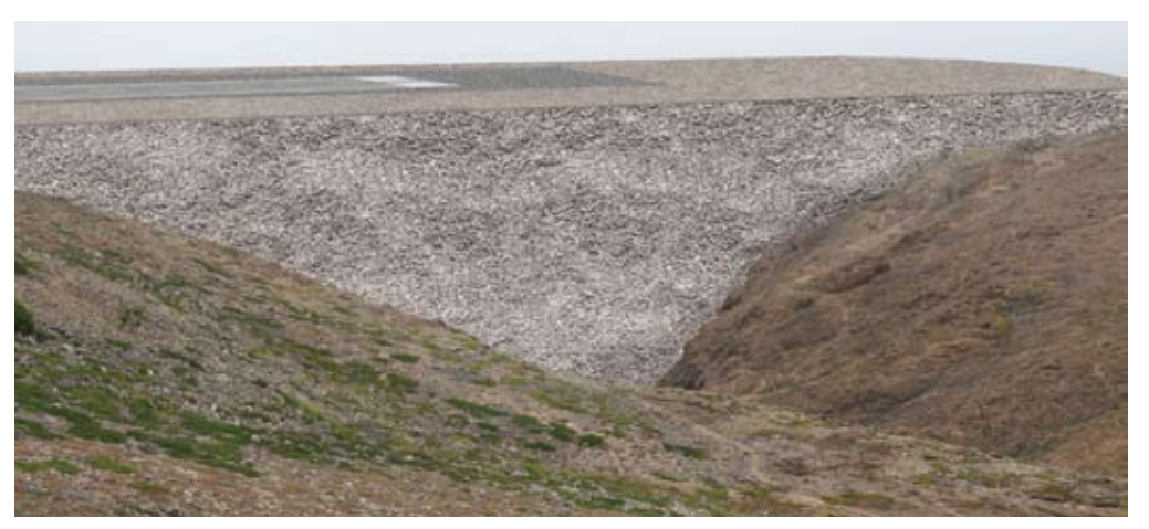
Figure 4 Artist's Impression and runway across Dry Gut