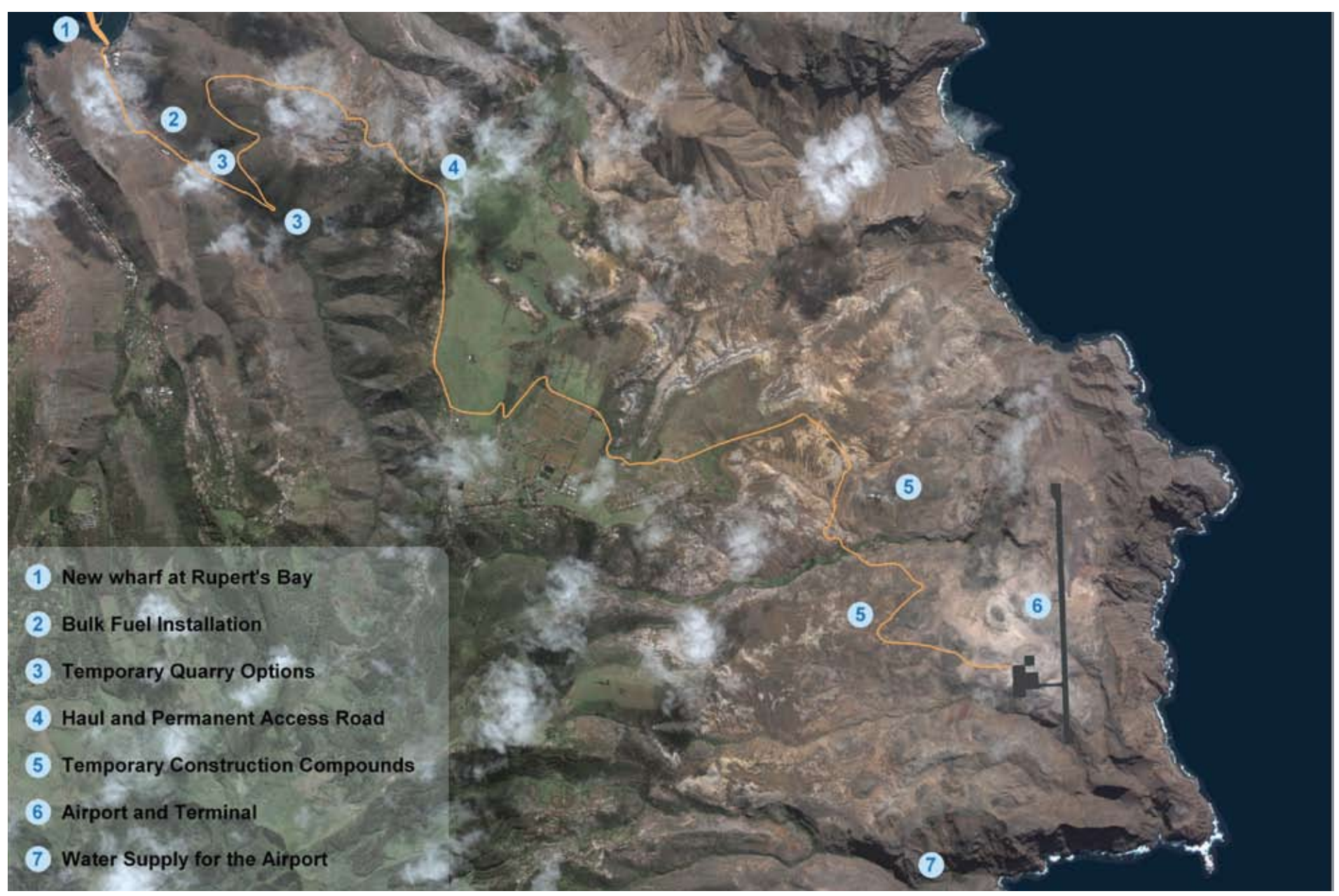
Figure 2 Proposed Airport and Supporting Infrastructure