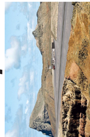
Passenger Terminal and Runway