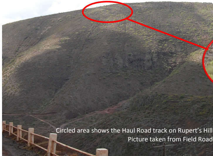
Circled area shows the Haul Road track on Rupert's Hill Picture taken from Field Road