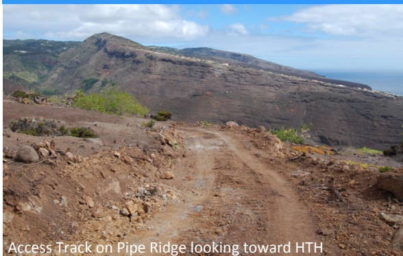
Access Track on Pipe Ridge looking toward HTH

Basil Read has started work on the 14km access track for the haul road. This access track will follow the general alignment for the haul road and will allow Basil Read to move their large machines from Rupert's to Prosperous Bay Plain. Works started in Bilberry Field and Mulberry Gut about two weeks ago. Work has now also started on the access track on Rupert's Hill.