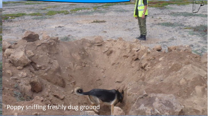
Poppy sniffing freshly dug ground