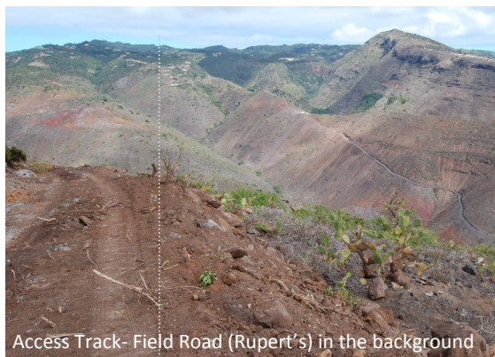
Access Track- Field Road (Rupert's) in the background

More pictures of the haul road track overleaf.