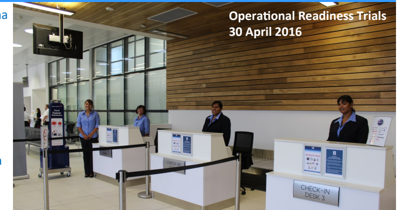
Operational Readiness Trials 30 April 2016

"The training to be a Security Officer at the Airport was very intense and hard work, but we had a great tutor from Lanseria. We all completed the training, with some 100% results among us. We are now Security Screeners who under the Security Supervisor are responsible for the safety of the Airport and aircraft when operational - which is a big responsibility. The Airport itself is a splendid building, world class, and whilst working there and doing on the job training, we have received comments that we are very professional with the screening process. The staff from Solomons who have trained as Security Officers come from different disciplines and I think we all did really well. I know the CEO is proud of us all."