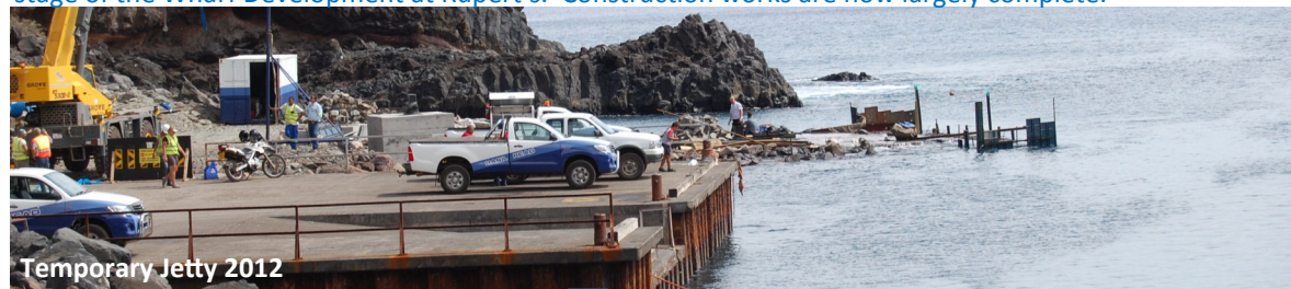
Temporary Jetty 2012

In September 2013 St Helena Government announced that approval had been given to move to the next stage of the Wharf Development at Rupert's. Construction works are now largely complete.