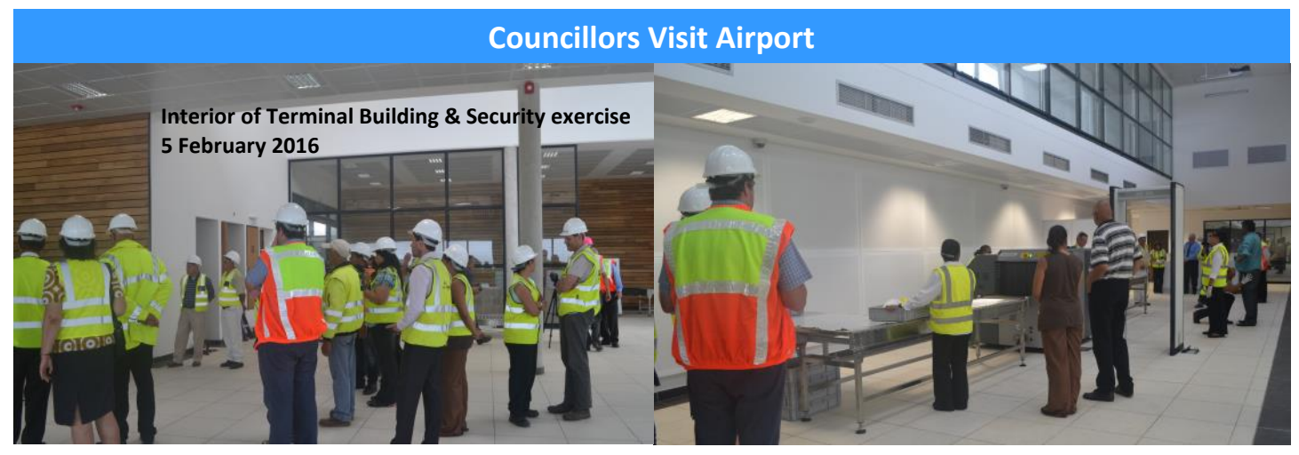
Councillors and SHG personnel visited Rupert's Wharf, LEMP Planting areas and the St Helena Airport Buildings on 5 February 2016. The visitors were able to witness and participate in the trial of some procedures at St Helena Airport.

"I feel privileged to have this opportunity to work with St Helena Airport's first ever operations team. With the collective skills and experience amongst the team, we will do our utmost to ensure St Helena has the safe and efficient airport that it so rightly deserves."