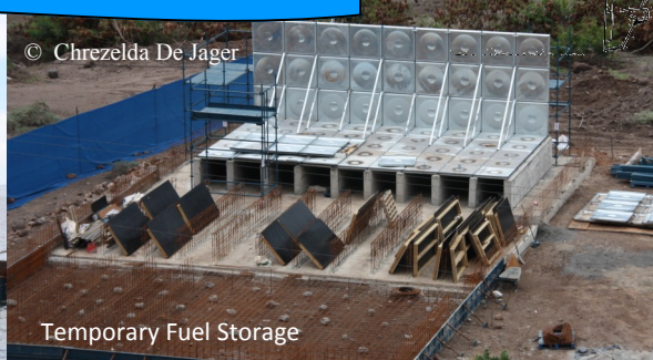
Temporary Fuel Storage