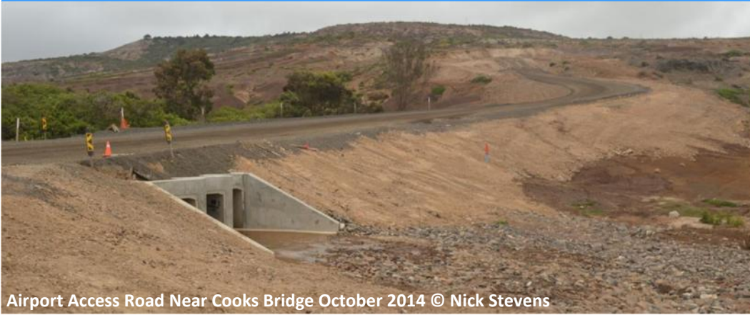
Airport Access Road Near Cooks Bridge October 2014

In recent weeks, there has been considerable concern over the increase in unauthorised use of the Airport Access Road. This is a public an environmental safety issue. The Access Road, as part of Airport Project construction, is necessarily closed to the public in most areas. Signs clearly indicate when access is restricted.