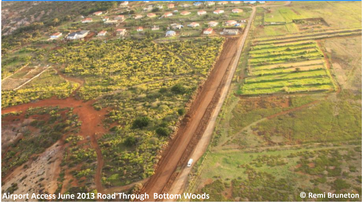
Airport Access June 2013 Road Through Bottom Woods