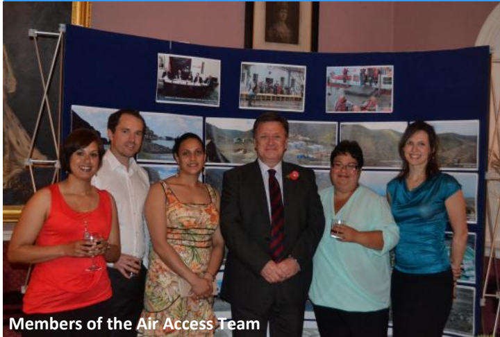
Members of the Air Access Team