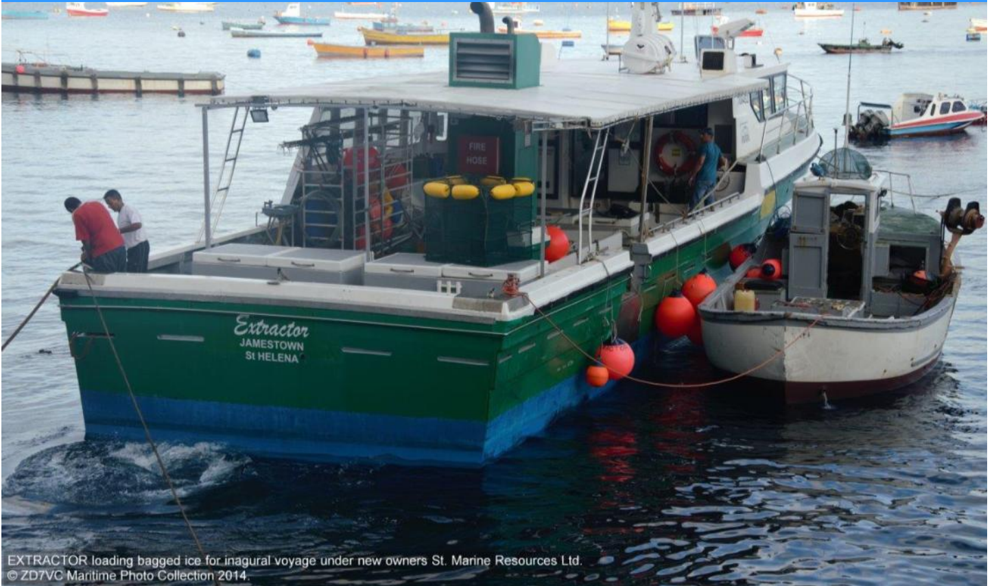
EXTRACTOR loading bagged ice for inaugural voyage under new owners St. Marine Resources Ltd.