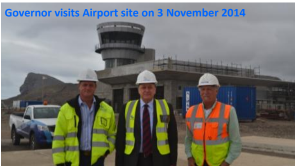
Governor visits Airport site on 3 November 2014