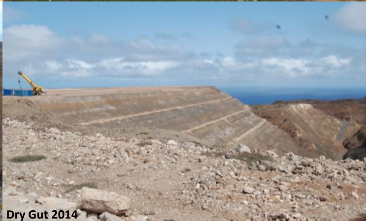
Dry Gut 2014