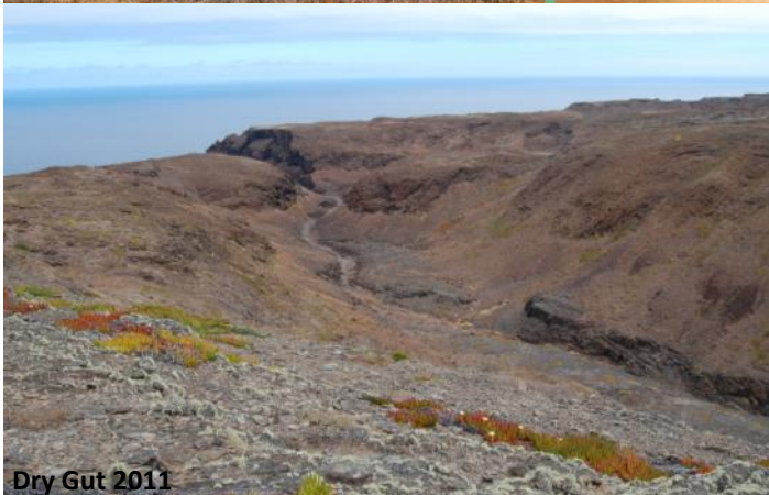
Dry Gut 2011