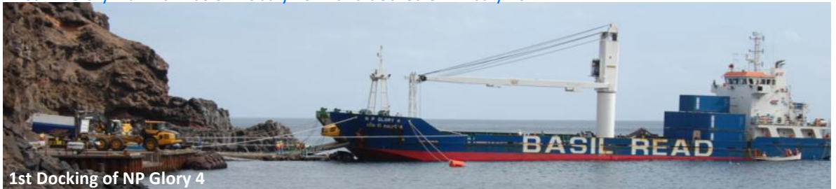
1st Docking of NP Glory 4

Work on Rupert's Jetty began on 27 February 2012 and was completed on 1 July 2012. The construction of the temporary Rupert's Jetty was to enable the NP Glory 4 to dock. The NP Glory 4 brings all necessary equipment and material to build the Airport, the Haul Road, Bulk Fuel Installation and Rupert's Wharf. The first NP Glory 4 arrival was on 10 July 2012 and docked on 11 July 2012.