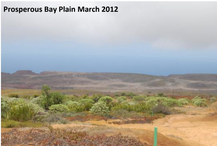
Prosperous Bay Plain March 2012

Work on the Haul Road began on 11 May 2012 and was completed on 15 September 2012 with a total of 54 blasts to construct the road. The road allows easier transport of equipment brought to the Island on the NP Glory 4 to the Airport Site at Prosperous Bay Plain and is envisaged to provide an additional route to St Helena's Airport, once completed.