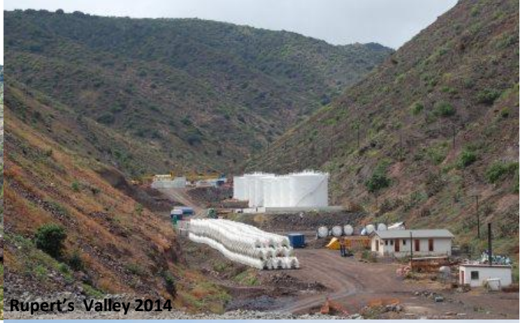
Rupert's Valley 2014