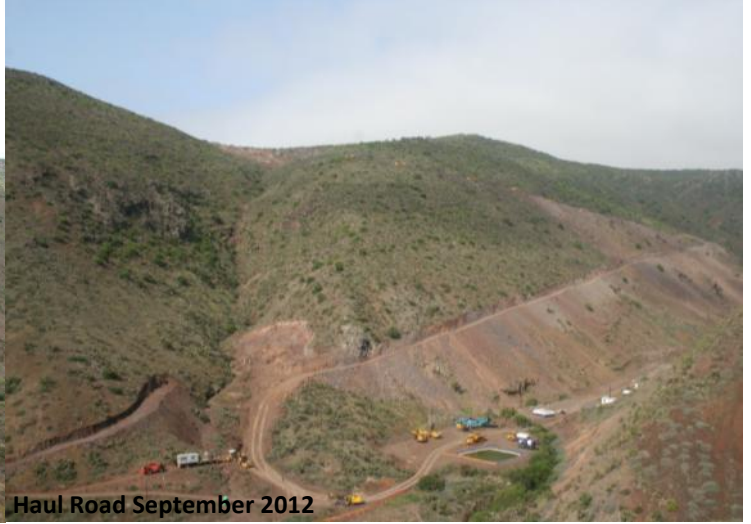
Haul Road September 2012

Work on the Haul Road began on 11 May 2012 and was completed on 15 September 2012 with a total of 54 blasts to construct the road. The road allows easier transport of equipment brought to the Island on the NP Glory 4 to the Airport Site at Prosperous Bay Plain and is envisaged to provide an additional route to St Helena's Airport, once completed.