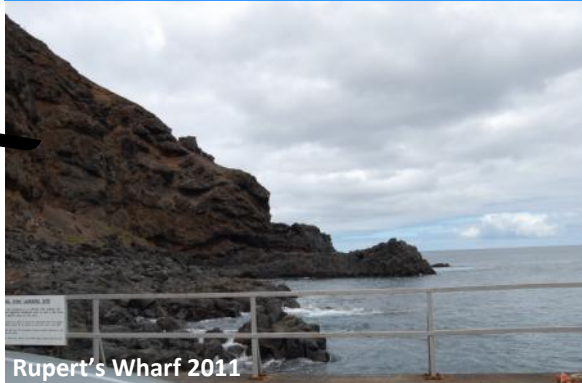
Rupert's Wharf 2011