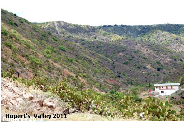
Rupert's Valley 2011