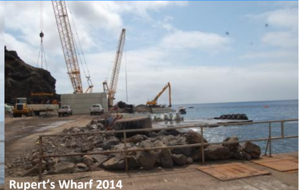
Rupert's Wharf 2014

Work on Rupert's Jetty began on 27 February 2012 and was completed on 1 July 2012. The construction of the temporary Rupert's Jetty was to enable the NP Glory 4 to dock. The NP Glory 4 brings all necessary equipment and material to build the Airport, the Haul Road, Bulk Fuel Installation and Rupert's Wharf. The first NP Glory 4 arrival was on 10 July 2012 and docked on 11 July 2012.