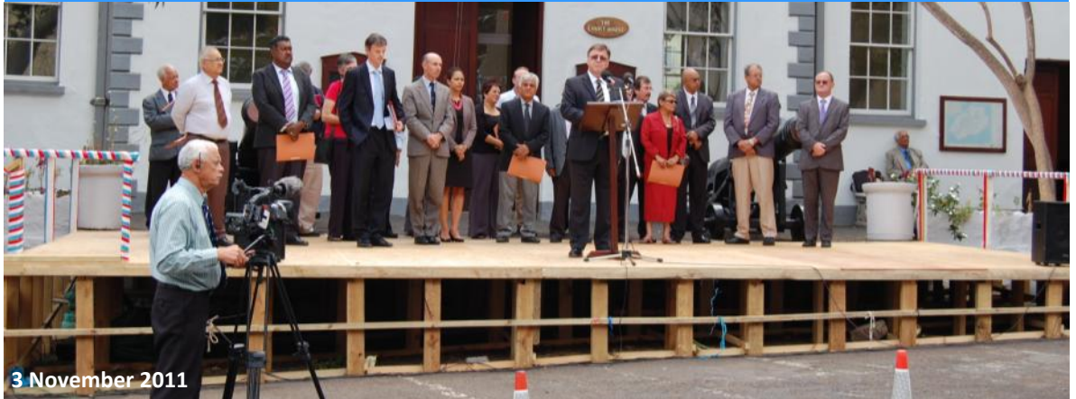
3 November 2011

On November 2011, St Helena Government signed a Design, Build and Operate (DBO) contract in DFID's London Office with Basil Read (pty) Ltd. The Contract was to design, build and operate St Helena's Airport and this was announced on the Grand Parade, St Helena on the same day (photo above). The project aims to provide air access to St Helena, fulfilling the UK Government's commitment to maintain access to the Island, and at the same time providing St Helena with a real opportunity for economic growth through tourism. Both St Helena Government and the UK Government hope that this will lead to eventual financial self-sustainability for St Helena. Since the signing of the contract, the Airport project has achieved many milestones. These include the completion of the temporary jetty at Rupert's, the 1st docking of the NP Glory 4, the blasting to create the Open Channel, the construction of the Haul Road, erection of the Airport Buildings and the filling of Dry Gut.