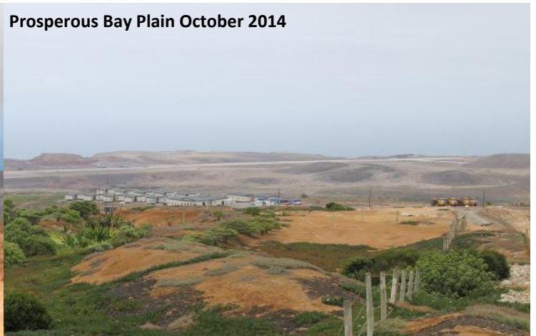
Prosperous Bay Plain October 2014