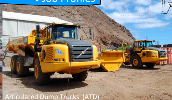
Articulated Dump Trucks (ATD)