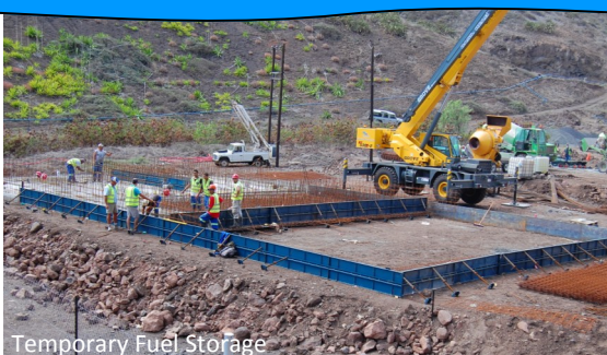
Temporary Fuel Storage

Issue No: 5 18th April 2012 Access Office, SHG