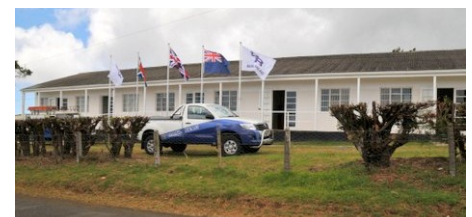
Basil Read Longwood Office

Thoughts about Basil Read and the airport project: It is an amazing opportunity to be a part of the Basil Read team and part of the Airport Project that will change the face of St Helena for the better and bring us into the 21st Century.