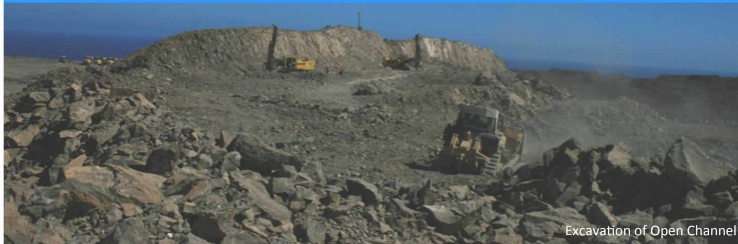
Excavation of Open Channel

2013 has been a remarkable year of achievement. Thanks are extended to all involved for their hard work and support.