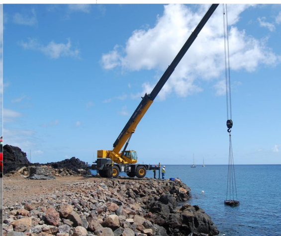
Temporary Jetty March 2012

We frequently get asked how many Saints are Basil Read employing and what type of jobs they are doing. Basil Read are currently employing nearly 70 Saints and close to 100 people in total.