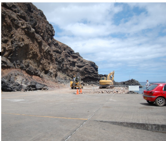
Temporary Jetty February 2012

The pictures below show progress to date.