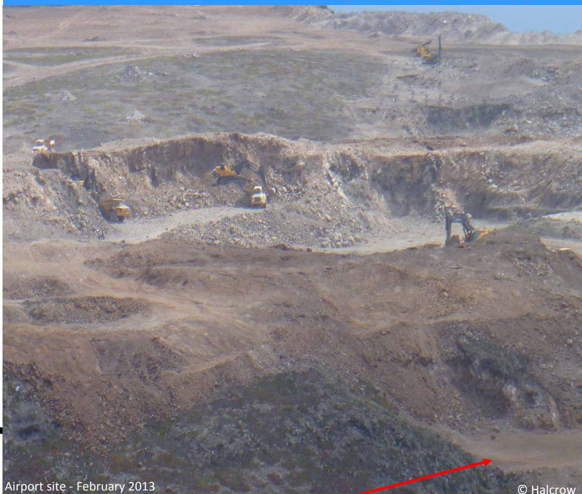
Airport site - February 2013