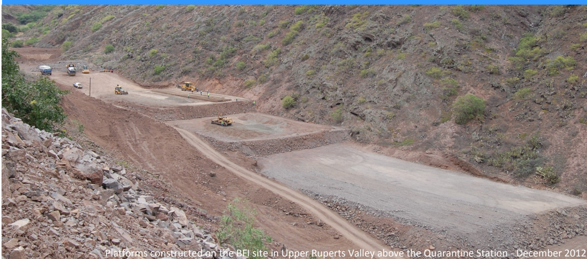
Platforms constructed on the BFI site in Upper Ruperts Valley above the Quarantine Station - December 2012