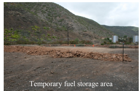
Temporary fuel storage area