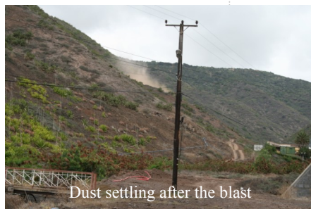
Dust settling after the blast

The public may also have noticed the works taking place to level the area behind St Michael's Church in Rupert's. Basil Read will be using this area as a temporary fuel storage facility.