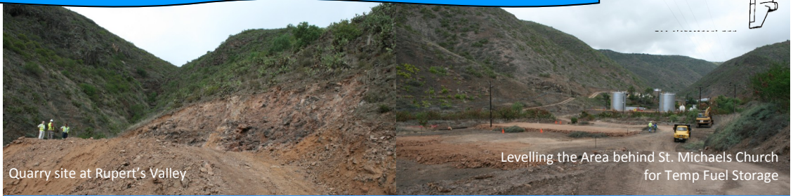
Quarry site at Rupert's Valley

Issue No: 2 7 March 2012 Access Office, SHG