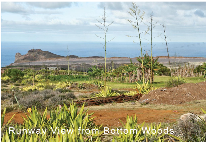
Runway View from Bottom Woods

What does the planning application cover?