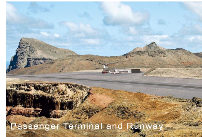
Passenger Terminal and Runway