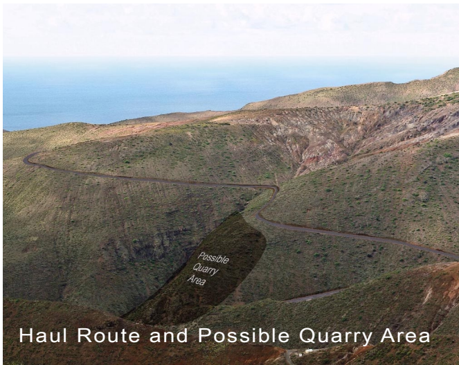
Haul Route and Possible Quarry Area