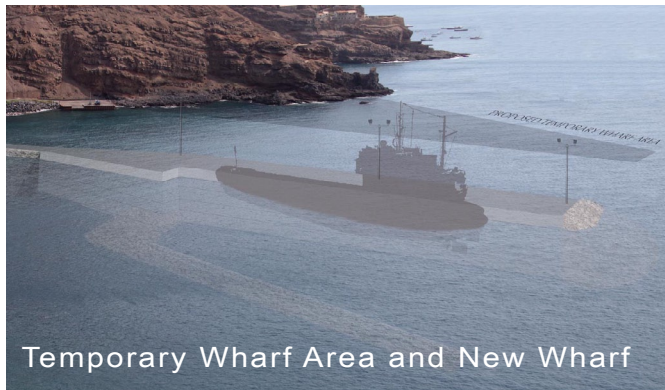
Temporary Wharf Area and New Wharf