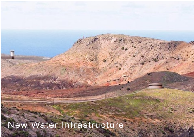
New Water Infrastructure