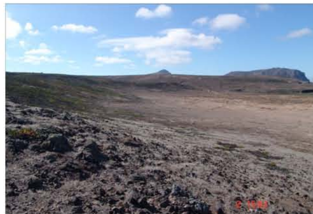
Photo 58: View West Across Western Part of Southern Ridge Slope Transition Zone