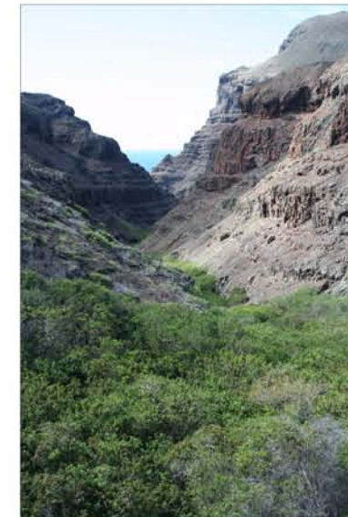
Photo 10.10: Extensive swathes of wild mango define the water course and cover the valley floor