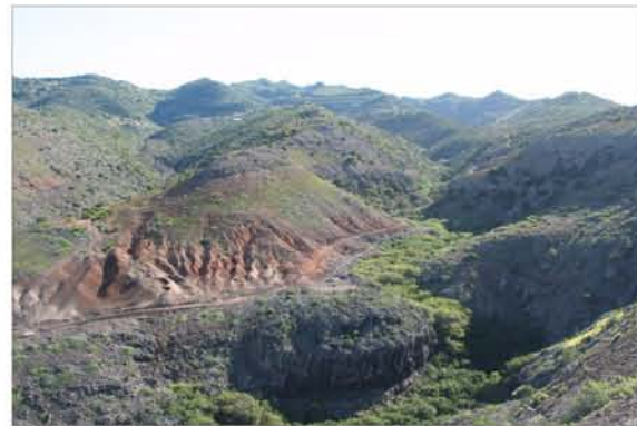
Photo 10.2: The upper section of Sharks valley with wooded and forested slopes rising to the high peaks in the distance