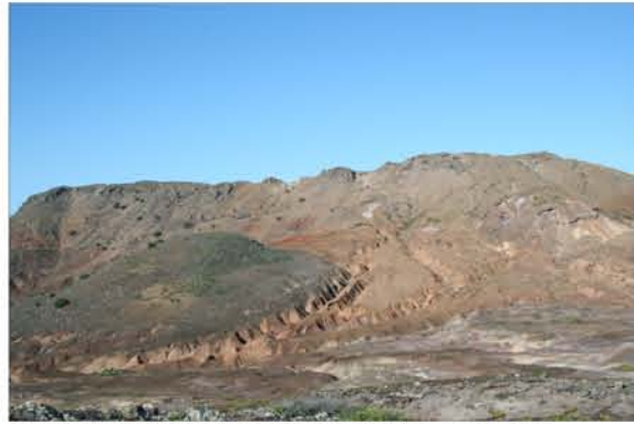
Photo 9.1: Extensive erosion gullies along the lower western slopes of Bencoolen