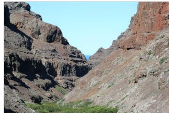
Photo 10.7: Steep valley sides converge on the narrow vegetated valley floor