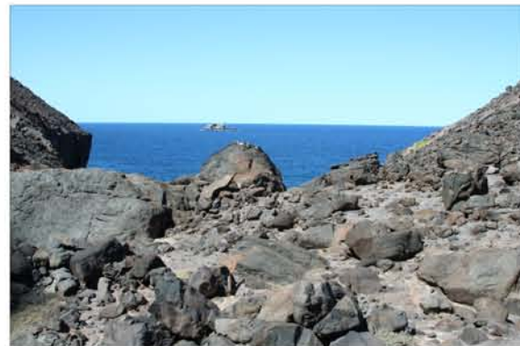
Photo 10.6: Rocky boulders are strewn across the valley floor towards the mouth of the stream