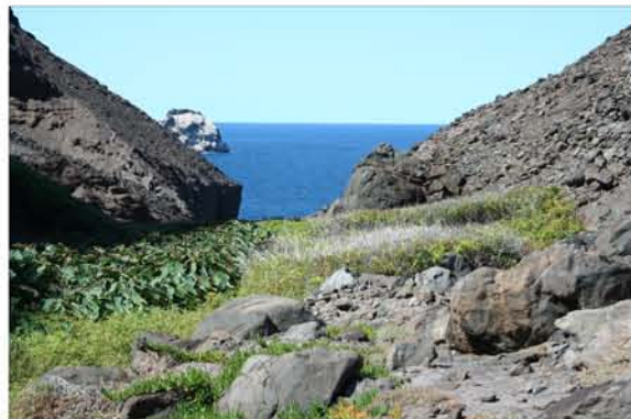
Photo 10.5: Vegetation including yam dominates the valley floor due to the constant flow of water