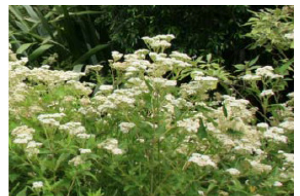
White weed on St Helena

White weed is an example of what can go wrong if biosecurity measures are not in place. It was imported over a century ago as an ornamental garden plant. No restrictions were in place then and no one checked what was likely to happen if it established itself here. More than a century later this has become invasive. It covers vast areas of land and can grow densely wiping out other plants, affecting our pastures and crops. Life would have been a lot easier if we had prevented it coming to the island in in the first place!