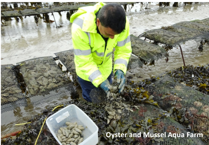
Oyster and Mussel Aqua Farm