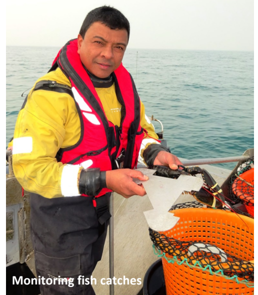
Monitoring fish catches