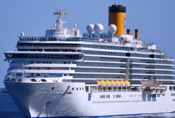
MV Costa Deliziosa

Italian registered and launched in 2010 the MV Costa Deliziosa has a tonnage of 92,600 with 17 decks and has the capacity to hold 2,260 passengers including 1,050 crew on board.