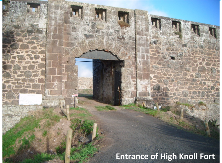
Entrance of High Knoll Fort