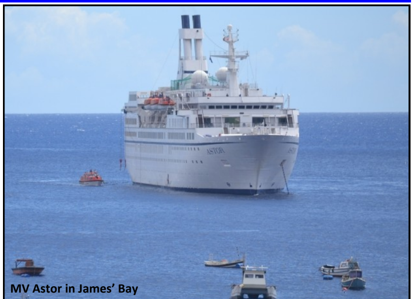
MV Astor in James' Bay

The next cruise ship visit will also be the MV Astor on 21 November 2014, en-route from Ascension Island to Cape Town.