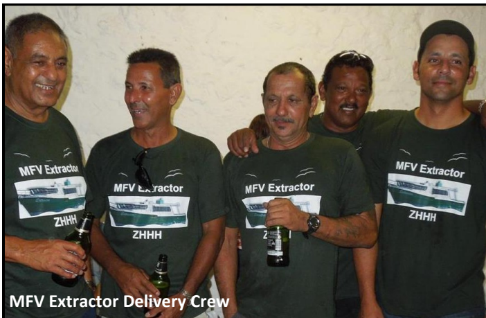
MFV Extractor Delivery Crew