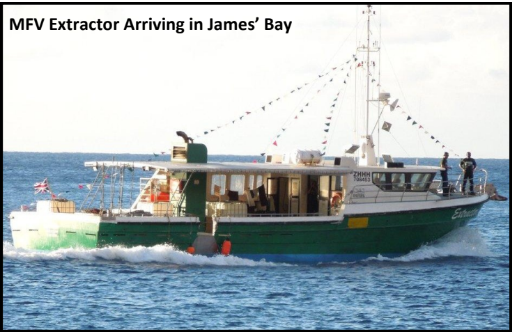
MFV Extractor Arriving in James' Bay

The Extractor was built in 1998 in Australia as a purpose-built long line/pole and line tuna fishing platform for use by the Great Barrier Reef commercial fishermen. The vessel is 22 metres in length.