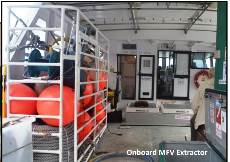
Onboard MFV Extractor