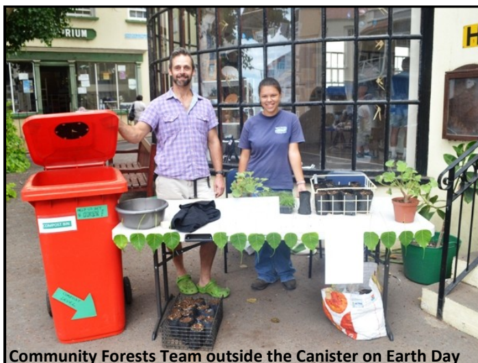
Community Forests Team outside the Canister on Earth Day